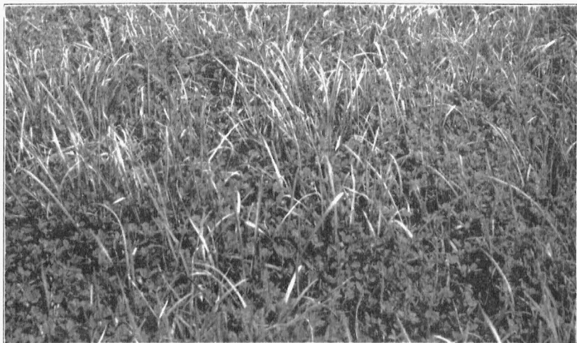
Korean lespedeza with orchard grass.

a grass-seeding attachment, seeding and fertilizing can be accomplished with one operation. Winter seedings of lespedeza are somewhat more hazardous than early spring seedings in southern Missouri because of premature warm weather followed by killing cold that sometimes occurs in that section.