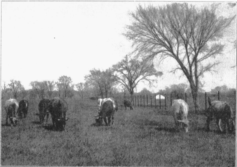
Late fall pasture provided by winter barley or rye.

Field Crops Department, Missouri Agricultural Experiment Station, and the Division of Forage Crops and Diseases, Bureau of Plant Industry, Soils and Agricultural Engineering, Agricultural Research Administration, United States Department of Agriculture, Cooperating.