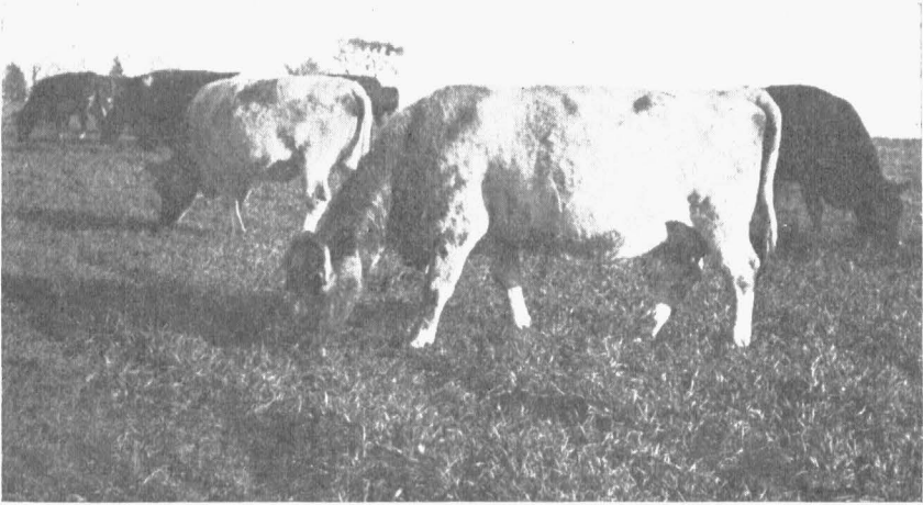
Fig. 3.—The vigorous, leafy growth of winter barley comes quickly from early sowing, and furnishes abundant pasturage through a long fall period.

following spring than oats sown in that season. An acre of land that is to be used for grain pasture will be found far more productive if fall-sown in winter barley, wheat or rye than if spring-sown in oats.