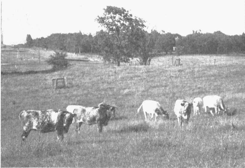
Fig. 1.—Bluegrass has long been a foundation crop of Missouri agriculture. It holds the key position in the all-year pasture system.