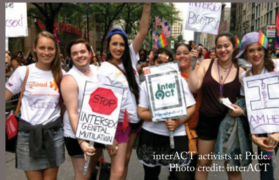
interACT activists at Pride.

interACT (formerly Advocates for Informed Choice) is based in the United States. This year, interACT is celebrating ten years of advocating for the human rights of children born with intersex traits