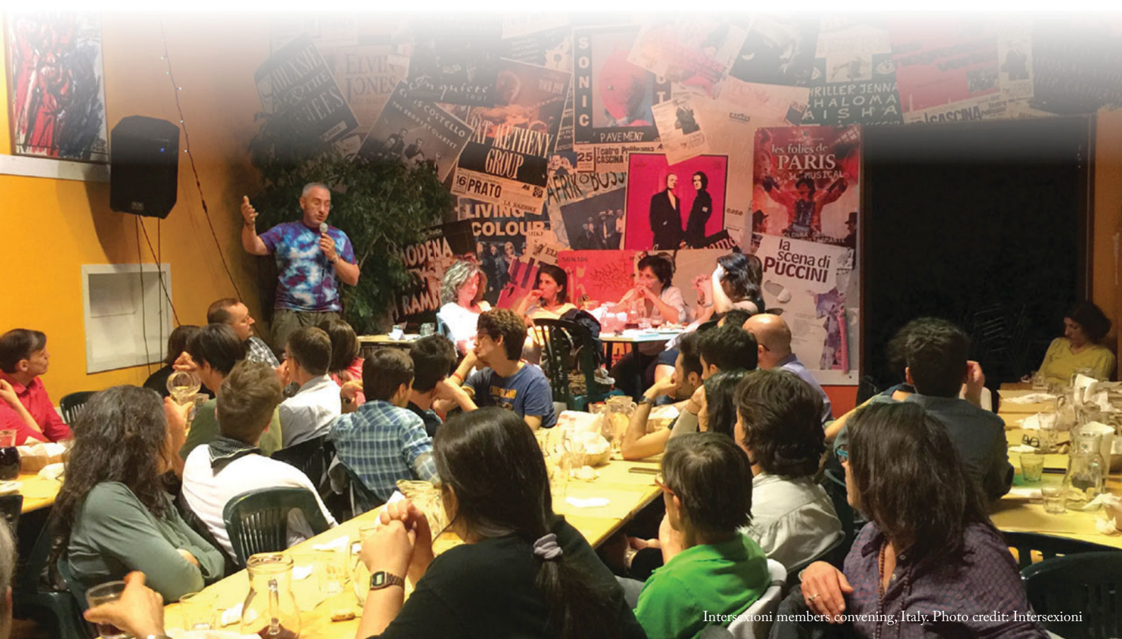
Intersexioni members convening, Italy.

“Sex characteristics” or “intersex traits” are terms used when referring to the features that make a person intersex; those terms have also been used in national legislation to protect the rights of intersex people. In some places, “inter*” is used to denote the diversity of intersex realities and bodies.