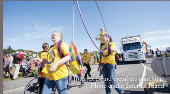
Intersex Ísland members marching.

Intersex Ísland was founded in 2014 to provide a safe space for intersex individuals, to educate the public about intersex issues, and to advocate for the principles outlined in the Malta Declaration. Among their first tasks was addressing the invisibility of intersex people in Iceland. An attitude of secrecy encouraged by the medical establishment and a lack of information in Icelandic language made “intersex” an almost unheard-of term. At the time of the organization’s founding, there existed only five pieces of writing on intersex issues in Icelandic and that were easily accessible to the public. This meant that Iceland had almost no non-medical discourse on intersex issues and that intersex people and their families felt disempowered to discuss their needs in the local language, often resorting to English. Intersex Ísland worked with a team of linguistic experts to develop a language base of non-pathologizing intersex terminology and, through public education and political advocacy, has been shaping an alternative discourse around intersex in the Icelandic language.