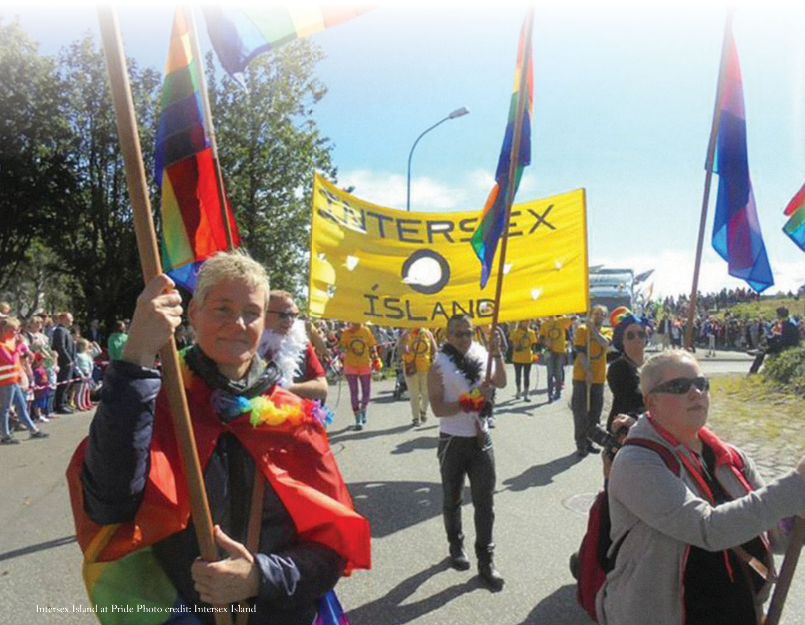
Intersex Island at Pride

We hope that this report serves as another stepping-stone towards further research, resourcing and recognition of this growing and vibrant movement.