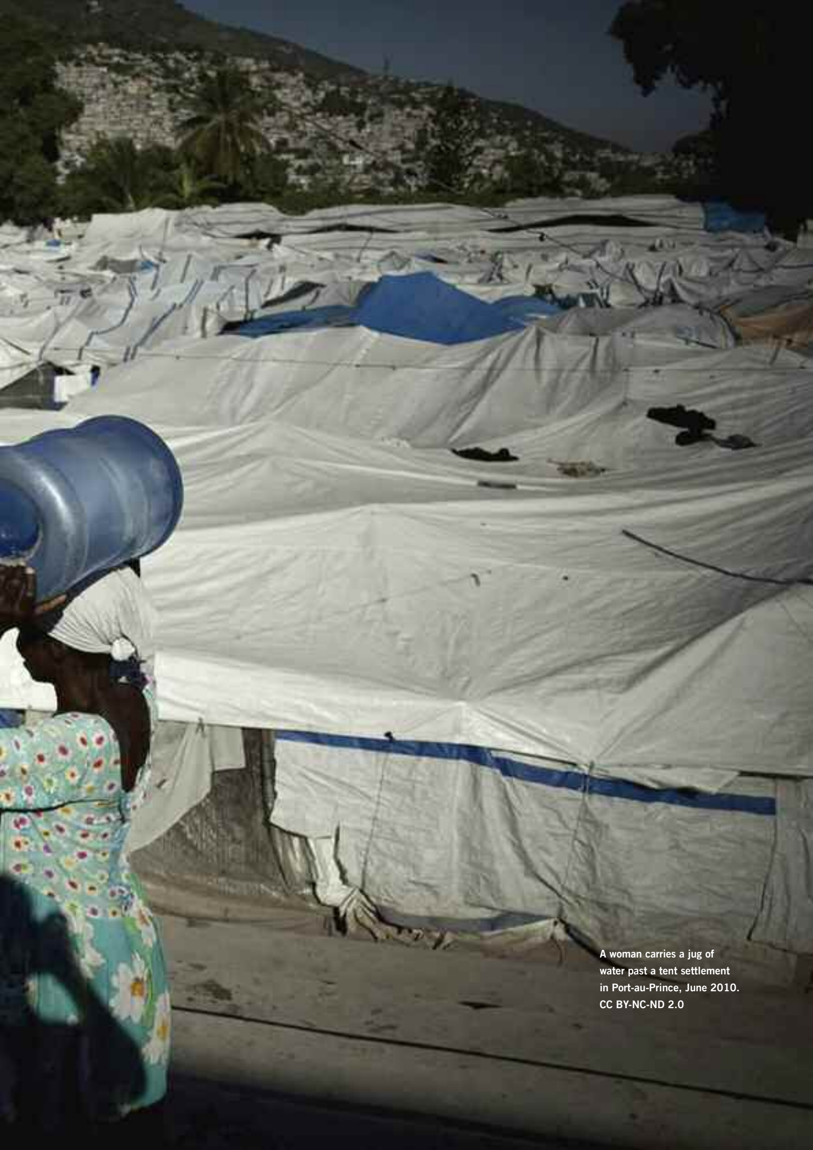
A woman carries a jug of water past a tent settlement in Port-au-Prince, June 2010. CC BY-NC-ND 2.0