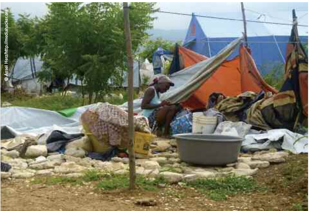
November 2010, Camp Carradeux, where tents destroyed by storms have not been replaced. Nearly a year after the earthquake, more than 1.3 million people are still displaced. CC BY-NC-SA 2.0