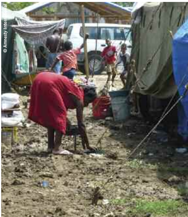
Far left: Camp Cozbami, Cité Soleil, July 2010.

Large families are crammed into tents or under tarpaulins with very little space per person. CC BY-NC-SA 2.0