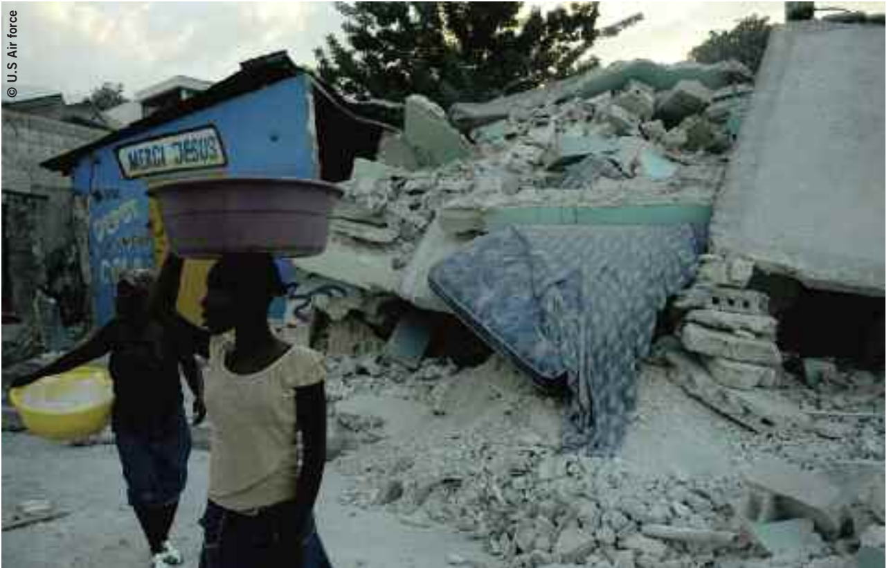
19 January 2010. Days after the earthquake, women walk amid the devastation in Port-au-Prince. CC BY-NC 2.0