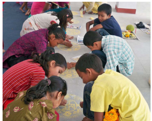
Children practicing their artistic skills