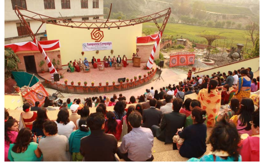
Closure ceremony of the Sampanna Campaign

Two major buildings, the Aanandi 1 and Aanandi 2 were completed within 1 year each from start to finish. Furthermore,