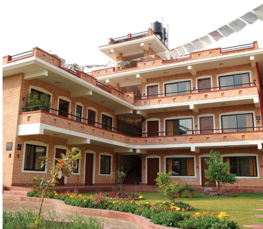
Residential facility: Anandi-2