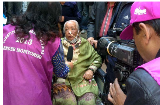
Volunteer interacting with elderly women during gender monitoring