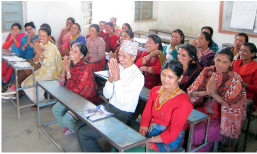
Participants of polygamy awareness training in Dalchoki, Lalitpur

Samriddha Nepal: Residents of Dalchoki may only be 20-25 kms from the main city, yet they are very isolated due to the terrain. It is a very small village development community situated on the southern part of the Lalitpur district with a high degree of ethnic diversity. The Tewa team walked an arduous 2 hours uphill journey and visited grantee partner Samriddha Nepal and the beneficiaries of the polygamy awareness training programme. The training was participatory and educated both men and women of the community on the causes and implications of polygamy as well as on national laws and policies related to many other forms of violence perpetrated against women.