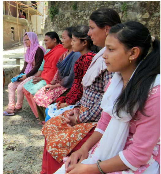
Beneficiaries of grantee partner, Society Initiated for Women and Children and Social Welfare

Society Initiated for Women and Children and Social Welfare: Beneficiaries of our grantee partner Society Initiated for Women and Children and Social Welfare in Lele, Lalitpur received a grant for leadership development training. All agreed the training was very effective in addressing the issues related to leadership, helped them in building self-confidence and strengthened their public speaking skills. Women are now able to assert their opinions and are capable enough to make decisions. They have become self-reliant and independent. They are increasingly addressing the discrimination and violence that women are facing and are rising to resolve these issues.