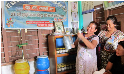
Beneficiaries of Sri Shatasi Mahila Mauri Palan Sahakari Sanstha Ltd displaying their honey products