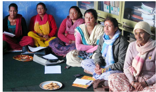
Members of Mahila Mukti Samaj in Dadeldhura

Mahila Mukti Samaj: It was in 2009 that Mahila Mukti Samaj was given the grant of NRs. 60,000 (US$ 600). Their goal was to make women in Dadeldhura, Far West Nepal aware of various types of violence against women and educate them about laws and policies with regards to Violence against Women (VAW). The organisation has established a name for itself in the community for standing up for women's rights and working primarily in the area of VAW. It has provided legal support, counselling and other services to nearly 300 violence affected women.