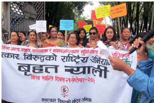
Determined women collectively rally to raise their voices against growing incidences of rape

This campaign provided a platform to women to share the issues faced during