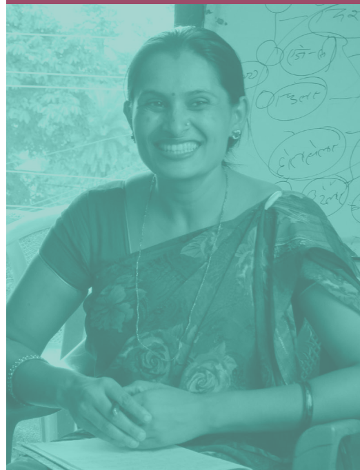
Beneficiary of Bibeksheel Mahila Krishi Sahakari Sanstha in Jhapa

Learn, advocate and and raise voices for women's rights collectively.