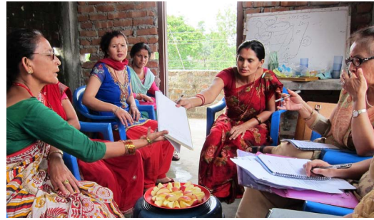
Members and beneficiaries of Bibeksheel Mahila Krishi Sahakari Sanstha in Jhapa, East Nepal