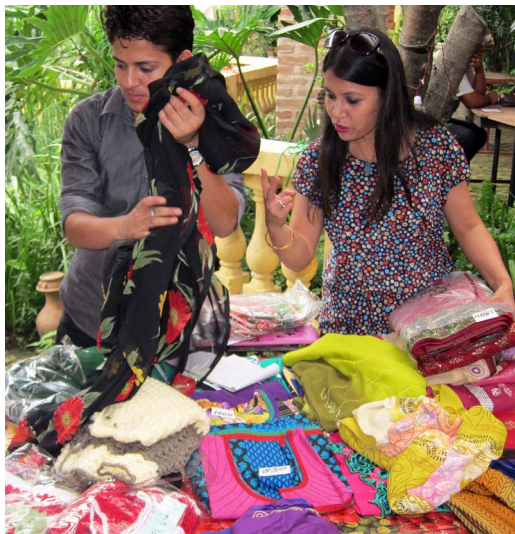
Volunteers at Tewa's fundraiser, Haat Bazaar

Come and visit us at the Tewa centre. We welcome all those who share our dreams. We would also love to hear your thoughts and ideas!