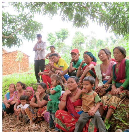
All staff exchanging experiences with the Chepang community in Dhading

An exposure trip was organised for Tewa staff to visit grantee partner Sahayatri Samaj in Dhading, Central Nepal. This trip gave us real insight into the lives of those we support. We witnessed a goat exchange programme and the distribution of scholarships to children of the Chepang 7 community. The visit was a valuable experience for all Tewa staff members, enhanced our understanding of the context, and reinforced the belief in our work.