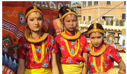
Children participating in a cultural programme

Through educational, recreational and cultural activities we have been able to engage the local younger generation, giving valuable insights into philanthropy, women's rights and the environment. We realised the importance of educating the youth from an early age and engaging our local community. As the children grow up, they will have a well-grounded insight into these fundamental issues. This has helped us to establish strong bonds with our community; it is mutually beneficial as we have learnt much from them.