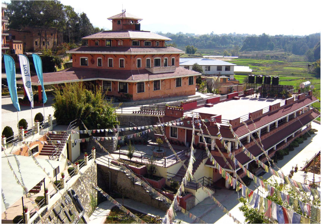
Tewa office building and residential facility - Anandi