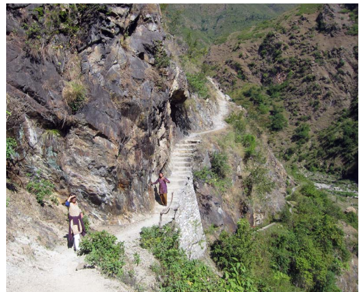
En route to Kotbhairab VDC, Bajhang, Far West Nepal

Mahila Srijana Samaj: Mahila Srijana Samaj is the only Tewa grantee in Bajhang district, one of the most remote and isolated districts situated in Far West Nepal. In 2014, in Kotbhairab VDC, Mahila Srijana Samaj received a grant of NRs. 300,000 (US$ 3,000) to start a campaign to sensitise the women and local stakeholders about the health implications of Chaupadi Pratha 6 in the region.