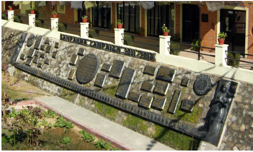
Sampanna Campaign Monument