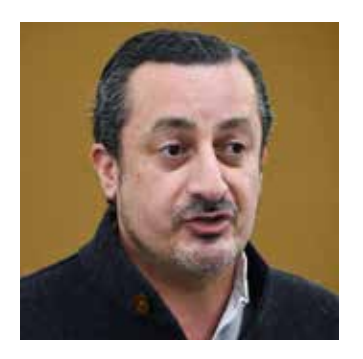
66 Food is a political act. We're doing conflict resolution through cooking. 99