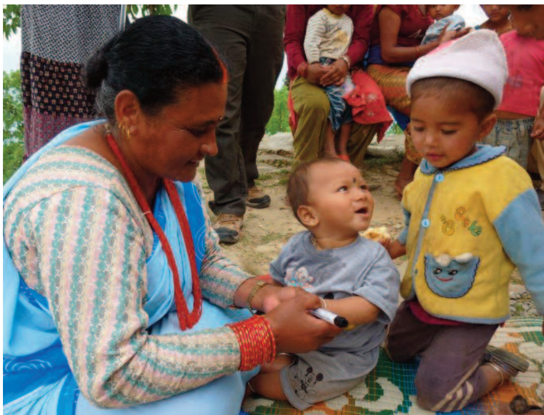
FCHV marking the fingernail of a vaccinated child at a rural vaccination booth, Kaski district.

Nine focus group discussions were conducted with mothers/carers of young children and with FCHVs in urban and rural settings of Kaski district. The four focus groups held among mothers/guardians (two urban, two rural) involved 17 participants, including one man. All individuals approached had vaccinated their children with the oral poliovirus vaccine. Table 2 details the socio-demographic characteristics of participants in the mothers/guardians focus groups.