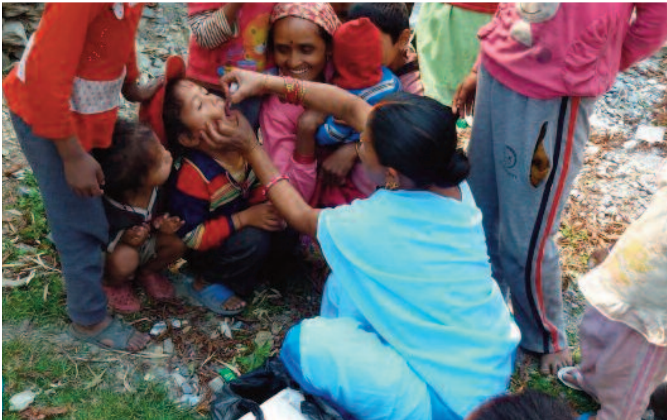
FCHV administering polio vaccine at a rural health post, Kaski district.

making promotion more convenient. The setting is also deemed to be more conducive to using a broader variety of promotion tools and methods, such as posters, films and handwashing demonstrations.