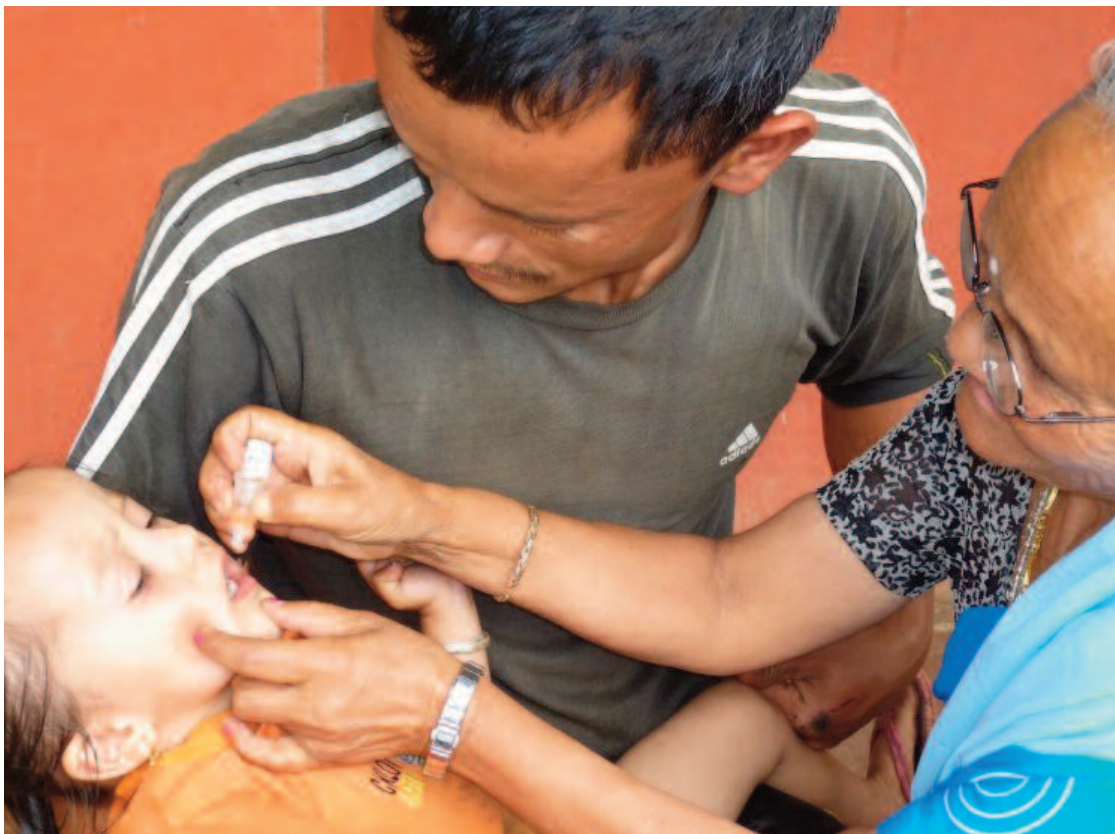
FCHV administering Polio vaccine in a rural vaccination booth. Kaski district.