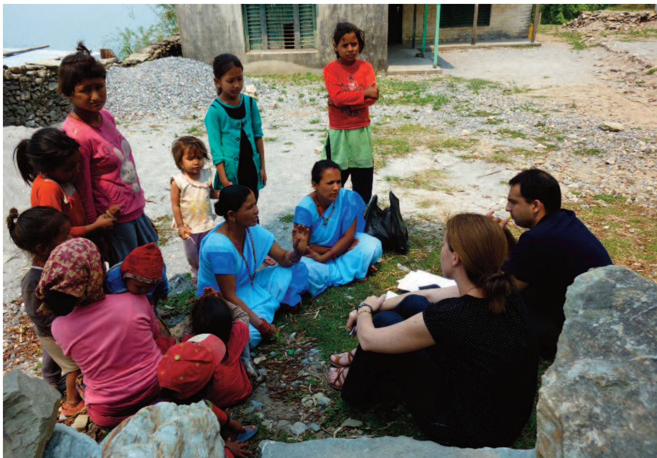
Researchers in discussion with FCHVs at a health post in Kaski district.