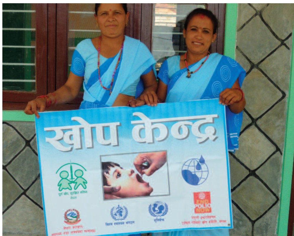
FCHVs holding the National polio immunisation day poster.