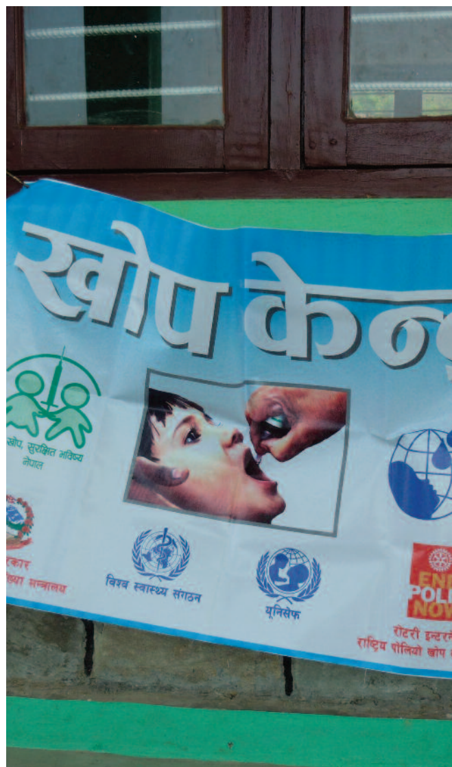
National polio immunisation day poster.

The practicalities of integration of hygiene promotion into immunisation programmes were discussed in the context of the current delivery mechanisms – campaigns and routine immunisation, outlined in table 3.