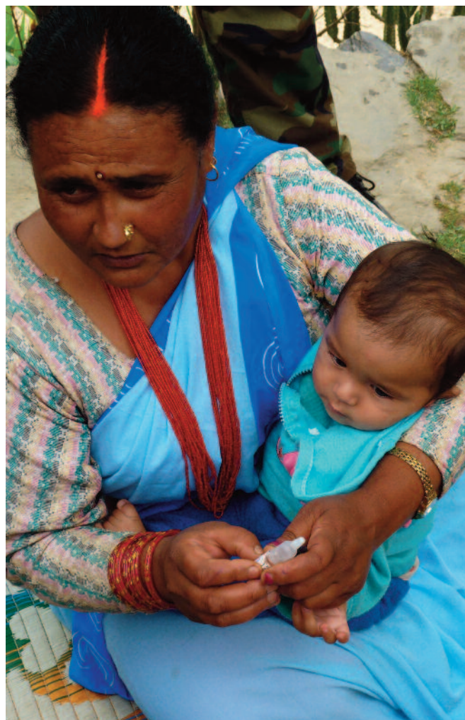
FCHV administering polio vaccine at a rural vaccination post, Kaski district.

Mothers/guardians: All mothers/guardians were highly motivated to vaccinate their children, pointing out that this motivation would not be reduced even if they had to travel further, or undertake a higher cost (since vaccines are provided free of charge, these costs relate to costs associated with attending vaccination booths/clinics, such as transport, food, cost of absence from work/household chores, etc). One participant said: “I never compromise with my child’s health. I don’t bother about the location of the booth and whether it is near or far, I prefer to vaccinate the child wherever it is. I would rather miss my work but I won’t miss the vaccination date to immunise my child”. All stated that they would be happy and willing to receive any information that will enhance their ability to protect their children from disease. In that respect, one mother stated that “if in future, children suffer from serious illnesses, it would cost more than coming here [for vaccination] now”. Another noted that “work is not more important than children – we would travel for any health message or vaccine”. Importantly, most participants, especially in rural settings, stated ‘being told by the FCHV’ as the main reason for attending the vaccination booth on the day. A high degree of trust in and respect for the volunteers was noted.