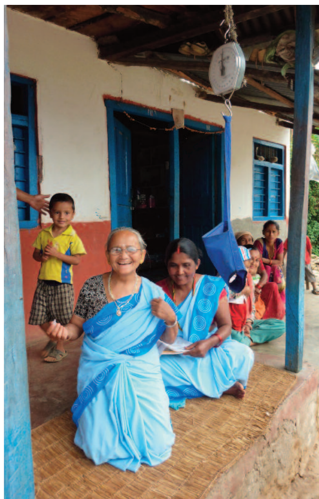
FCHVs at rural vaccination post, Kaski district.

WASH could potentially play a role in improving vaccine efficacy. Crucially, orally-administered vaccines have