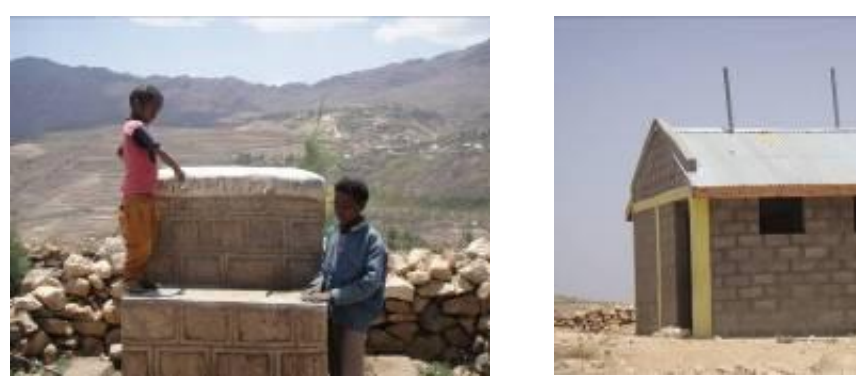
Inaccessible water points and latrines in school in Hintallo

The school WASH project in Hintallo is totally inaccessible for small children and pupils with disabilities. The water point height is very high and the entrance of the latrine is raised. This reveals the need to create awareness and lobby for the inclusion of accessible designs in school WASH.