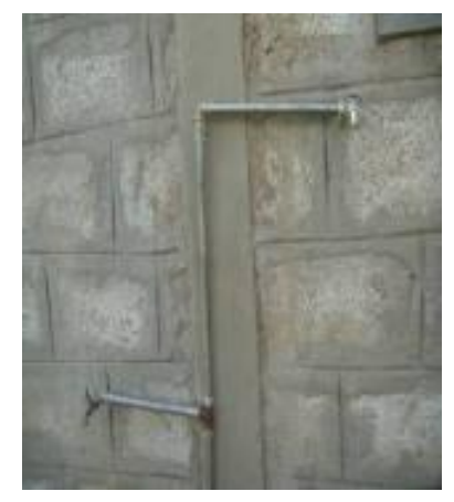
Water points at different heights