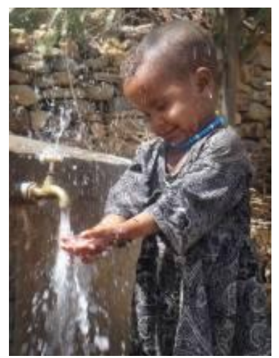
Child washing their hands In the Hintallo project

The presence of WASH facilities at the community level markedly improved the health situation of children. In Hintallo, the community agreed that the wellbeing of children is considerably better now than before and according to information from the health bureau of the woreda, the incidence of diarrhoea and other diseases has been reduced by 33% since implementation of the WASH project. In our focus group discussions, mothers also told us that they now have time to feed their children, wash their clothes and bath them daily. Mothers in Hintallo also said that they are now able to feed their children properly with vegetables from their gardens. The research team also observed that the hygienic condition of the children looked very good.