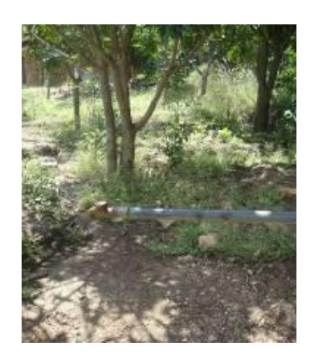
Non functional faucets in a school in Konso