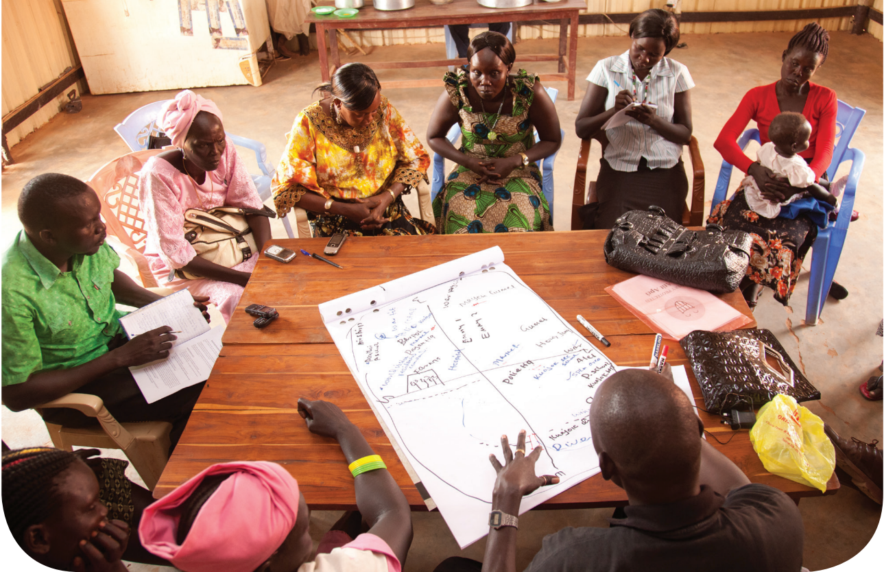
Kuajok, Warrap State, South Sudan. Community security focus group.