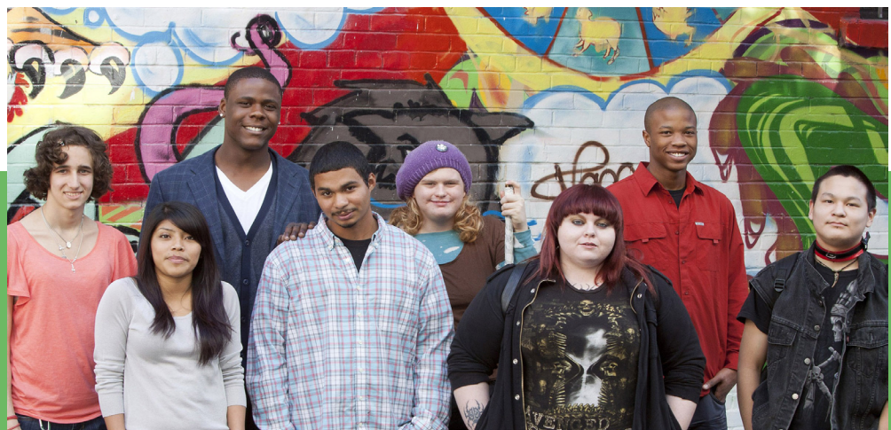
Larkin Street, San Francisco, CA

Youth unemployment has broad and costly implications for society. In terms of lost economic potential and higher government spending, the estimated cost of opportunity youth's disconnection from school and work is upwards of $250 billion per year—or a loss of $4.7 trillion over the lifetime of an opportunity youth cohort. 23