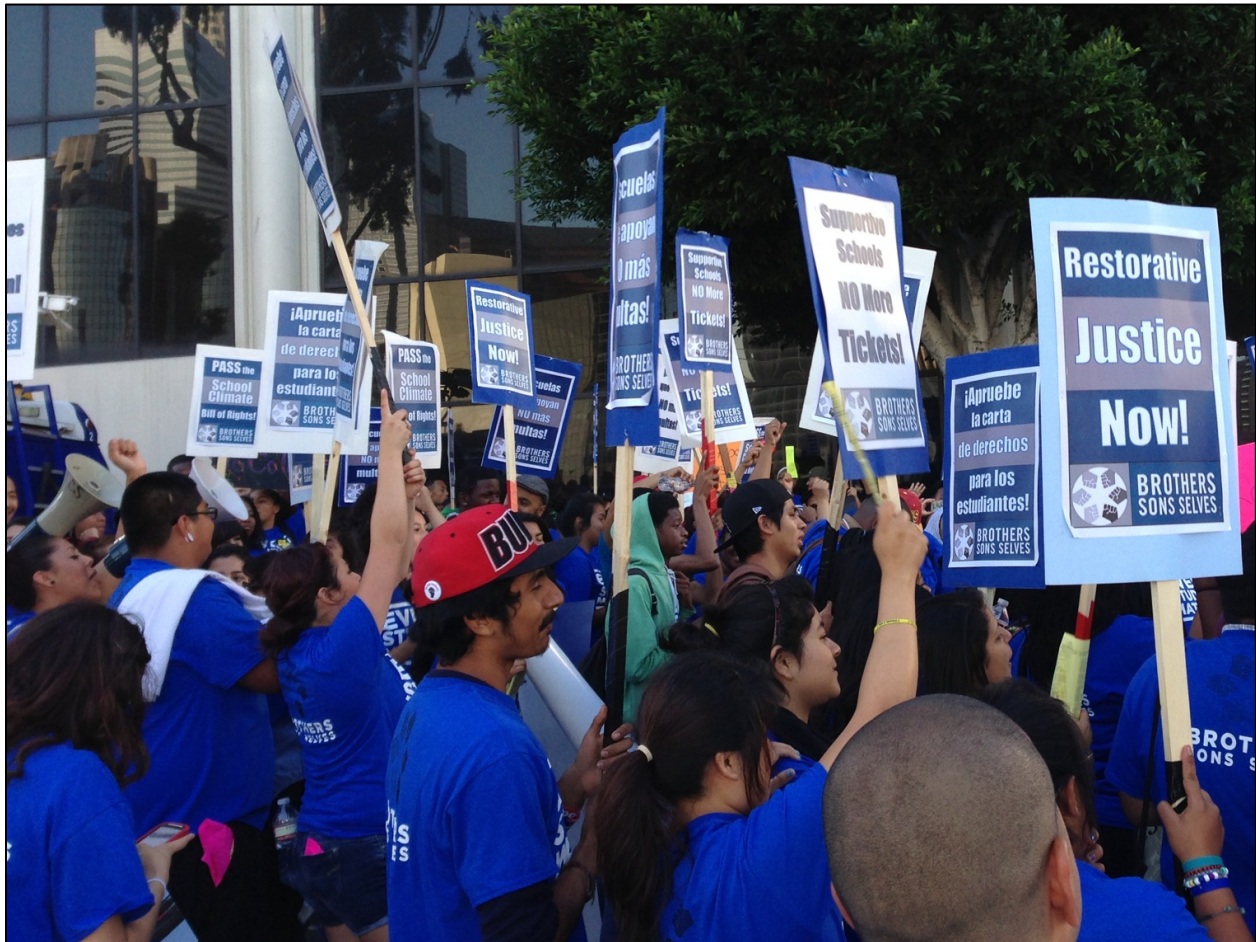
Student leaders with the Every Student Matters campaign rally at LAUSD for the passage of the School Climate Student Bill of Rights, May 2013.