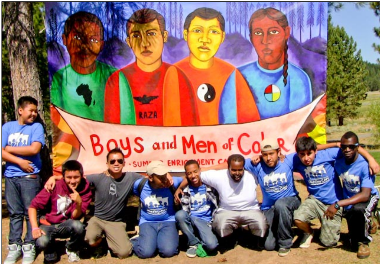
Youth leaders from City Heights participate in the 2012 BMoC Summer Enrichment Camp.