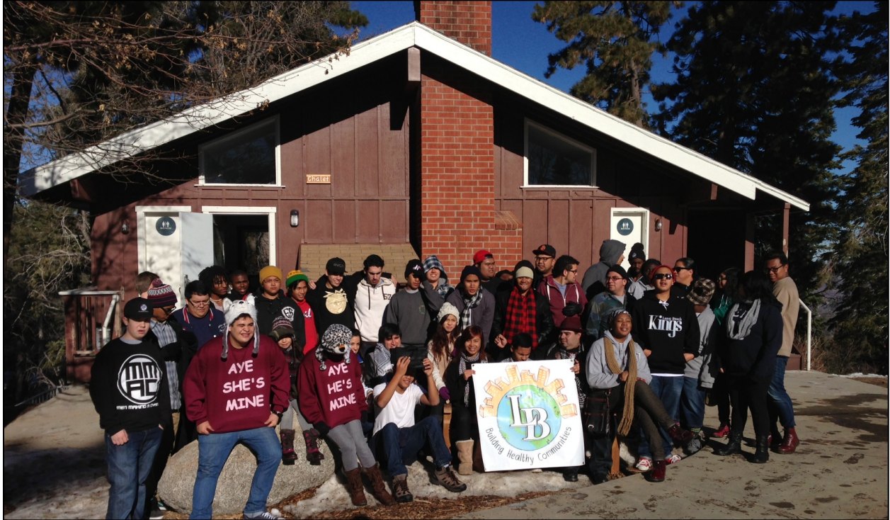
BHC Long Beach Youth Committee Retreat, January 2013.

Although KGA and CFJ were the initial BMoC grantee organizations in Long Beach, early on in the process the effort engaged staff and youth leaders from other BHC Youth Workgroup organizations, including Centro CHA, EM3, and CCEJ. The Youth Committee and Workgroup serve as the “hub” for BHC and BMoC youth organizing efforts. This alignment was evident at the Community Forum that publicly launched the Every Student Matters campaign. Nearly 300 students, parents, and community supporters convened to hear the perspectives of student and parent leaders from KGA, CFJ, CCEJ, Centro CHA, and the African American Convening Committee and began to build bridges with the Teachers Association of Long Beach to bring a Restorative Justice agenda to LBUSD.