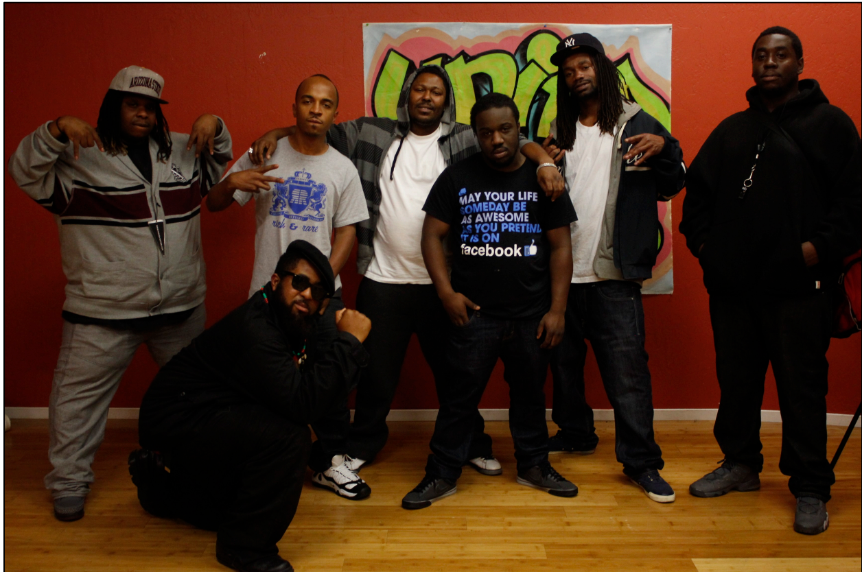
Members of the first Oakland DetermiNation circle cohort.