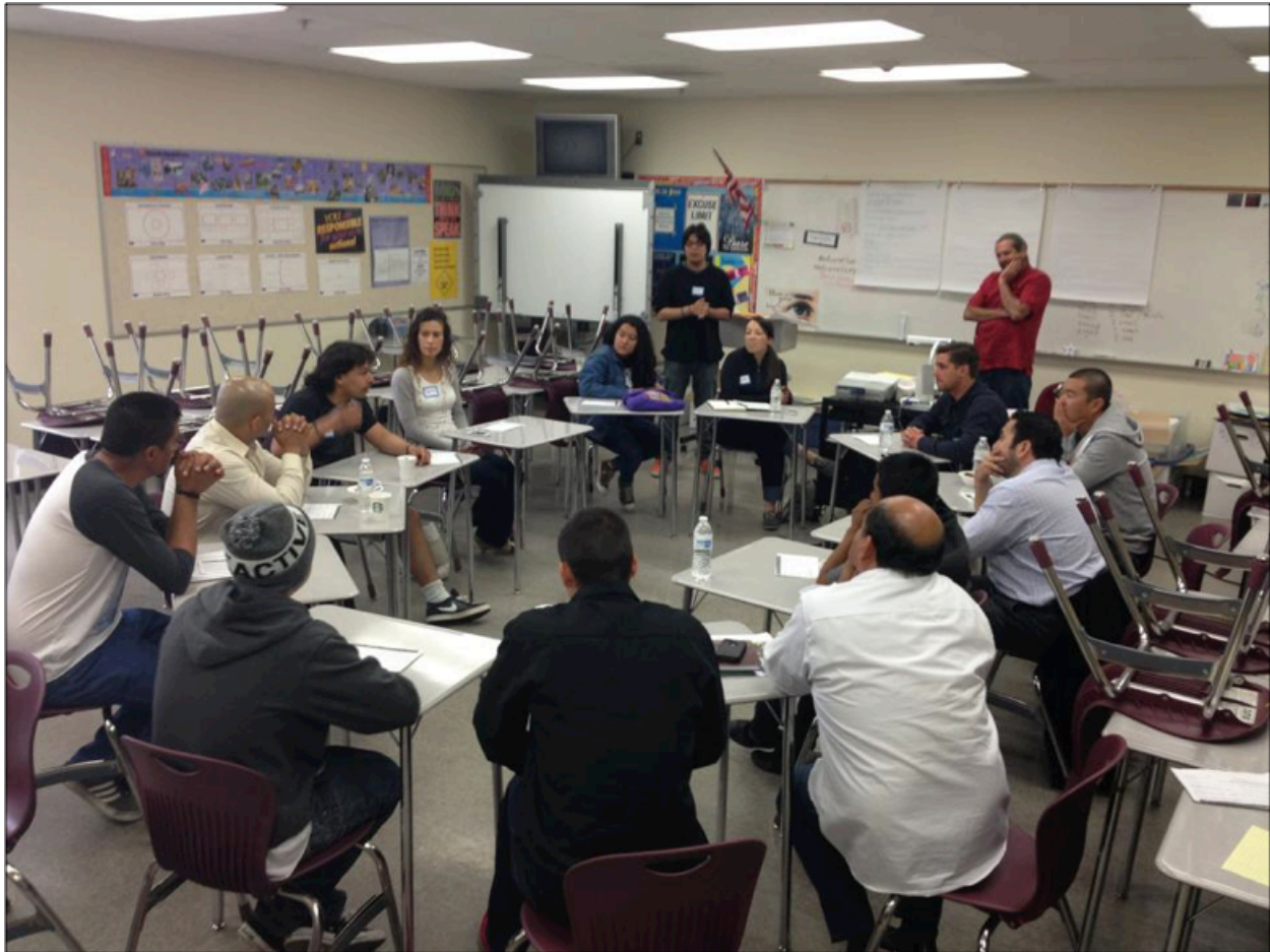
Discussion around educational issues affecting young men of color in Santa Ana during the April 2013 Boys and Men of Color Summit.

vulnerable. Another event took a creative approach to different learning styles and addressing key issues facing Boys and Men of Color in Santa Ana. Instead of organizing a typical workshop session, the group organized one-on-one conversations between five adult mentors and five youth leaders during a hike. The activity paired up adults and youth, which allowed the youth to bring up topics to discuss and the adults to connect more deeply with youth based on their shared experiences.