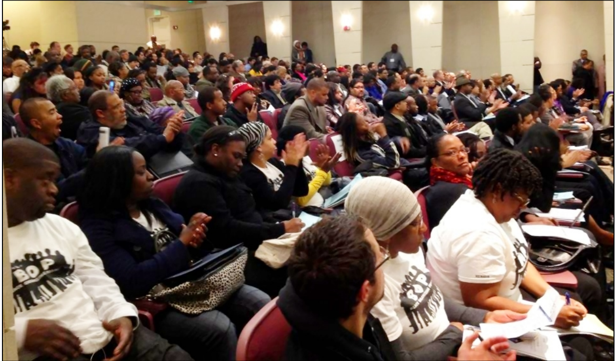
Participants at the Oakland Hearing of the Assembly Select Committee on the Status of Boys and Men of Color.