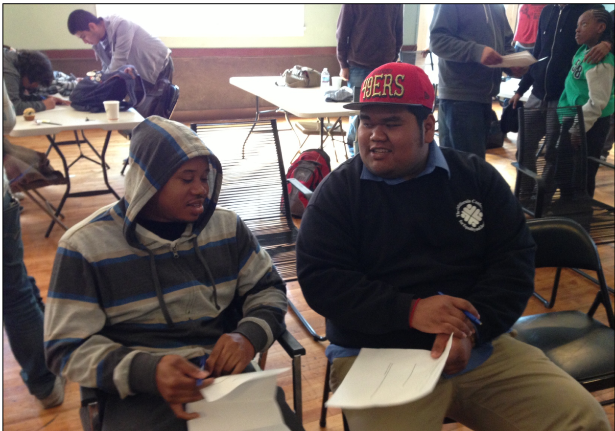
Brothers, Sons, Selves coalition leaders exchange stories during a coalition retreat, March 2013.