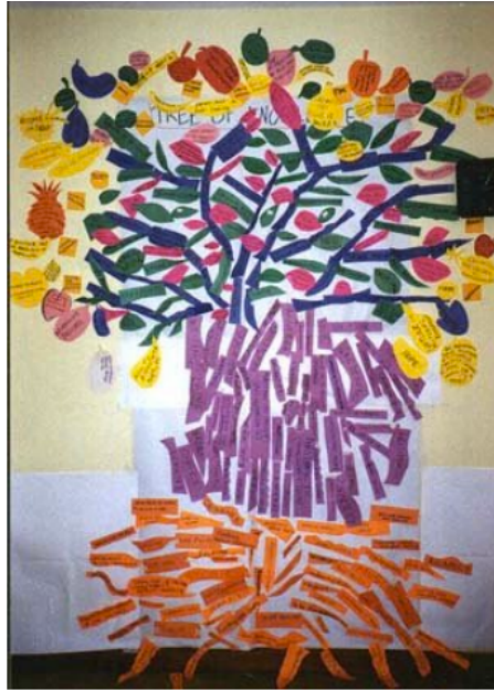
Figure 1: An example of a Tree of Strengths Mural