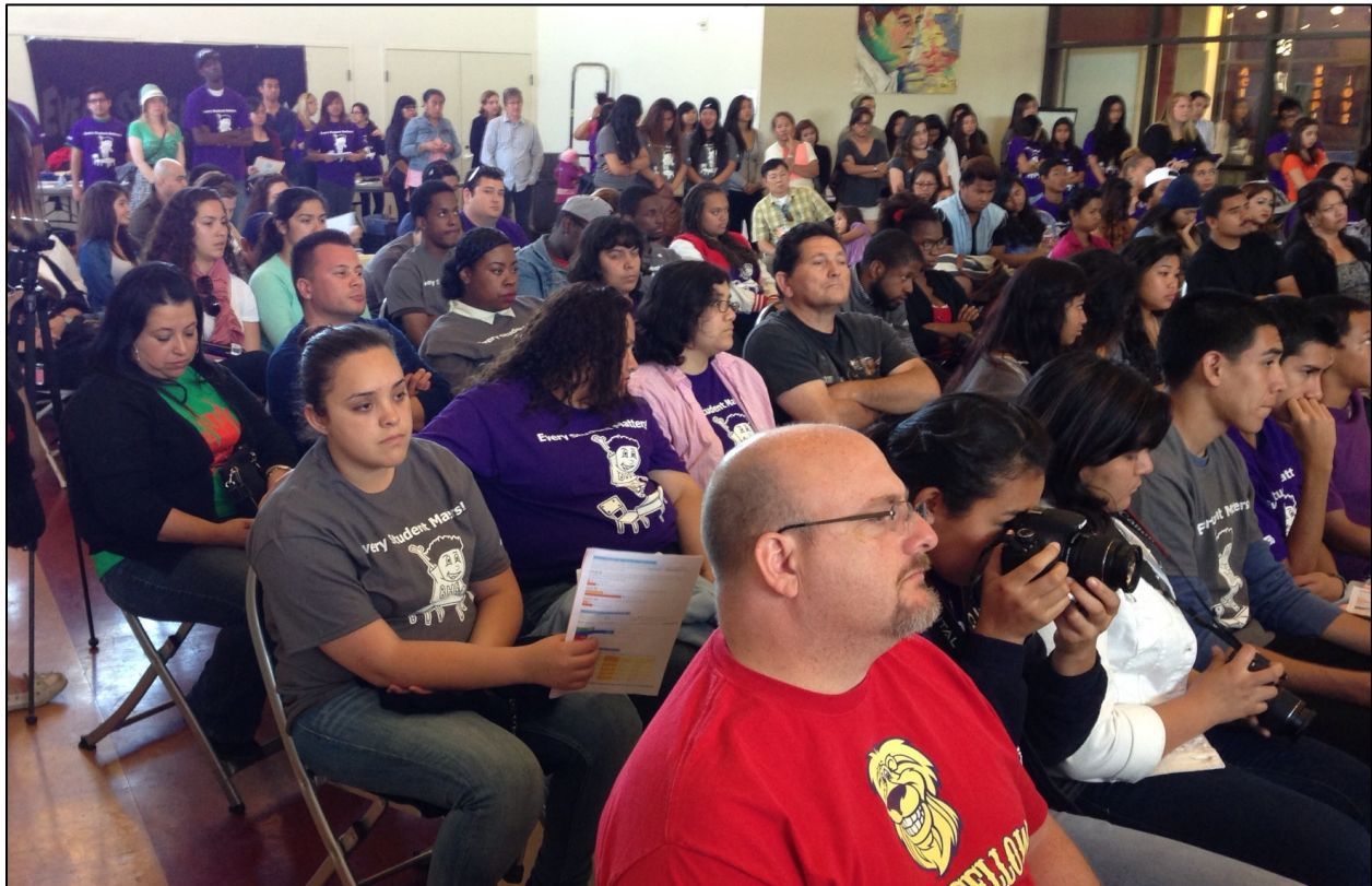
A packed house at the Long Beach “Every Student Matters” campaign launch in March 2013.

healthier community in Long Beach. The intentional emphasis on building relationships between young people and supporting adults from different BHC youth organizations, ensured that a strong foundation of youth leadership was in place before the Youth Committee launched the “Every Student Matters” campaign, focused on school discipline reform.