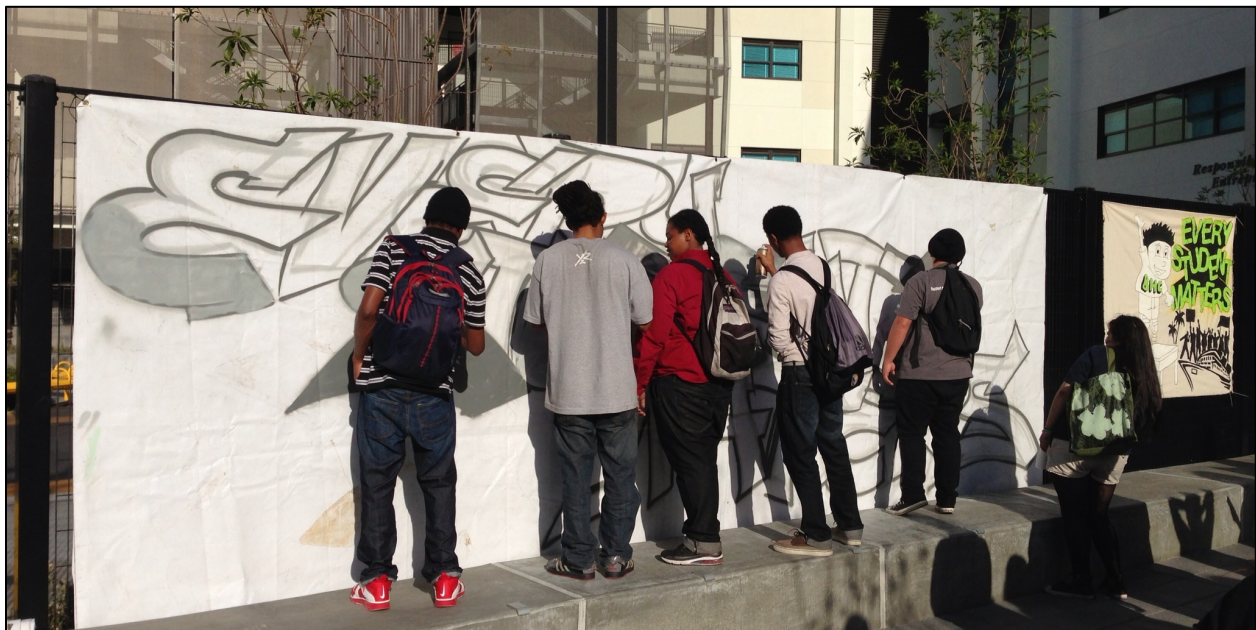
Live graffiti art at the April 2013 Los Angeles “Every Student Matters” campaign launch.

In addition, subcommittees provide rich opportunities for youth leaders to engage in hands-on campaign work and build hard skills and analysis. Because young people make up the majority of the membership of the subcommittees, they provide the space for youth to generate creative ideas and have ownership over final decisions on campaign plans and goals, with a few adult allies providing guidance and support. The “Base Kings” subcommittee, which focuses on base-building and recruitment for the coalition, developed a plan that mobilized more than 350 youth and community members for the Every Student Matters campaign launch in Los Angeles in April 2013 and created a grassroots petition drive to build broad-based support for the School Board resolution. The “Nation Builders” subcommittee, which focuses on leadership development, popular education, and campaign messaging, developed creative activities and a social media action plan for the campaign launch, including an Instagram “photobooth” where participants at the launch posted photos and thoughts about the campaign issue using the #EveryStudentMatters hashtag created for the campaign.