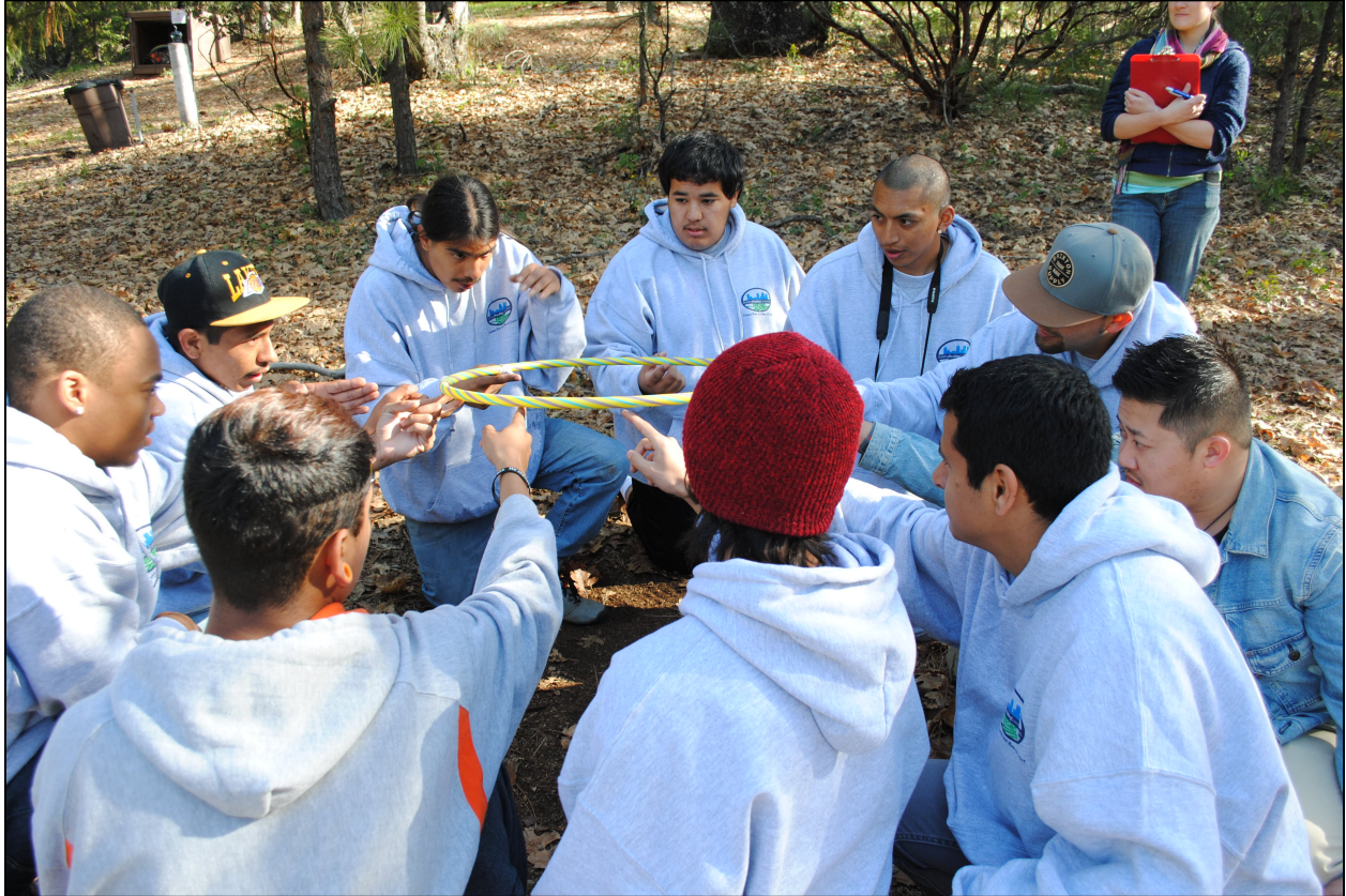
Leaders from the Fresno Boys and Men of Color Youth Table at the BMoC Camp.

A specific example of this collaboration grew out of work to organize a BMoC camp with BHC grantees and young men of color. The camp “provided the opportunity to talk about issues affecting boys and men of color, build relationships with each other, and most importantly provided opportunities for BHC grantees to present their campaigns and encourage young men to engage in those campaigns,” recalled Montes de Oca. Fresno SUCCESS team leaders presented their work on restorative justice and provided opportunities for BMoC youth leaders to get involved. As a result, Fresno saw good turnout of young men of color at an April 2013 restorative justice rally planned by the SUCCESS team.