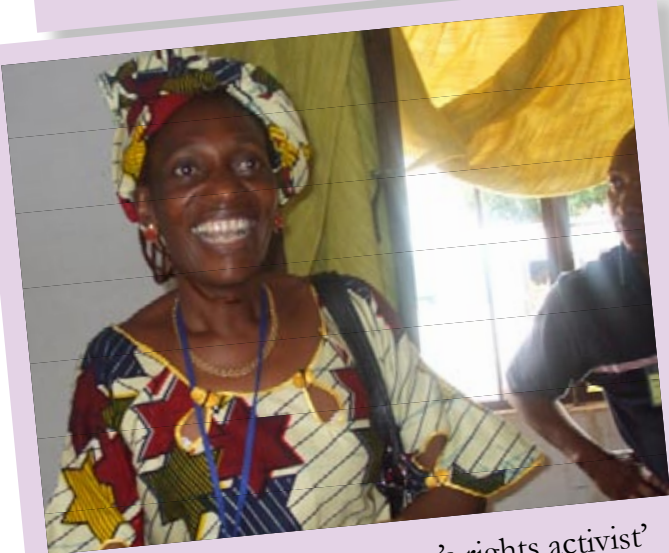
'Mama Dorothée, women's rights activist'