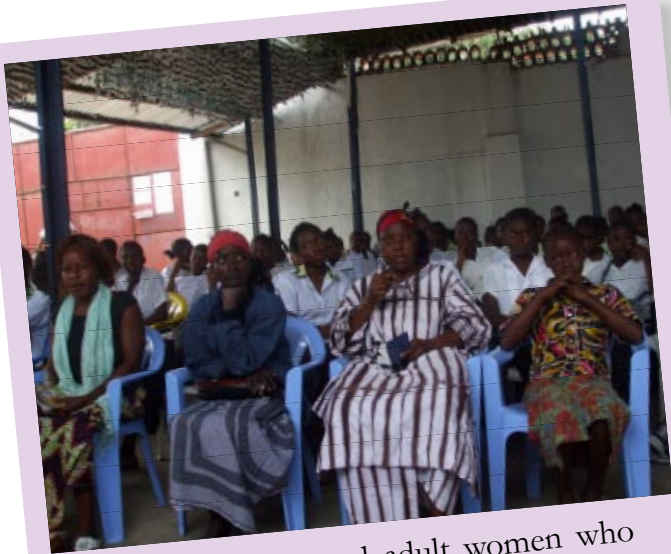
'School children and adult women who are beneficiaries of UFEVEOVIG'