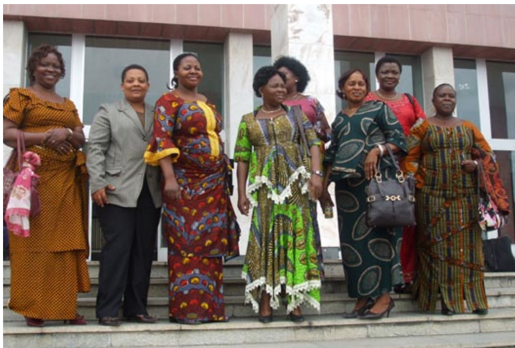
'Women Members of Parliament, members of the women's caucus in the Kinshasa Parliament'

» Low levels of education and self confidence - Women tend to be less visible in parliament, appear timid and hardly make contributions to debates. This latter challenge can also be attributed to a lack of knowledge in some subject areas. The other challenge raised by the parliamen-