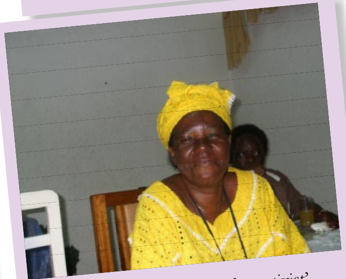
'Mama Rose, women's rights activist'