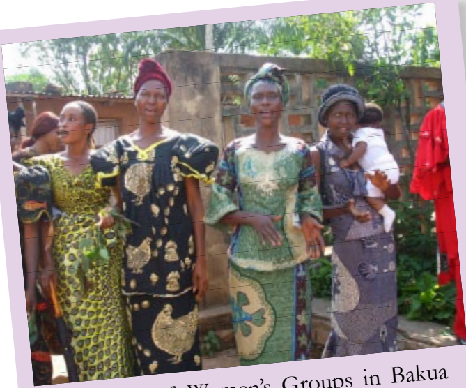
'Members of Women's Groups in Bakua Tshimuna'