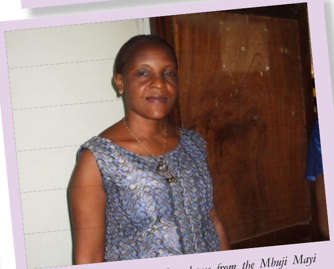
'First woman to get a first degree from the Mbuji Mayi University'