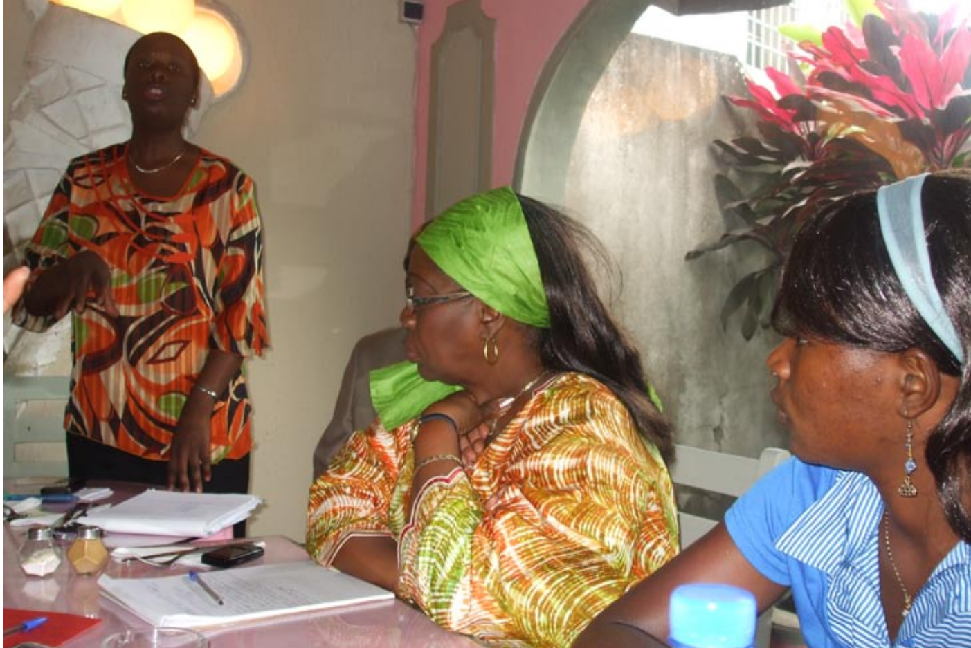
'Some members of the Kinshasa Gender Caucus...members are women and men'

series of conversations around Article 14 of the constitution, nothing has been done yet. Practically speaking there is no gender parity in the political arena. The Women's Caucus stressed that as women parliamentarians they had come together to advocate on social issues such as the HIV/AIDS pandemic and greater numbers of women in parliament would lead to greater attention paid to issues predominantly affecting women such as sexual violence and HIV/AIDS.