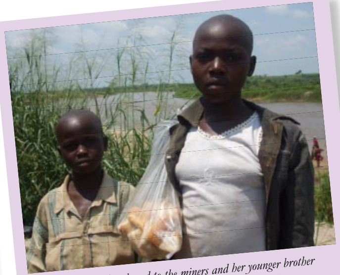
'Young girl selling bread to the miners and her younger brother who had been asked to accompany her for her security'