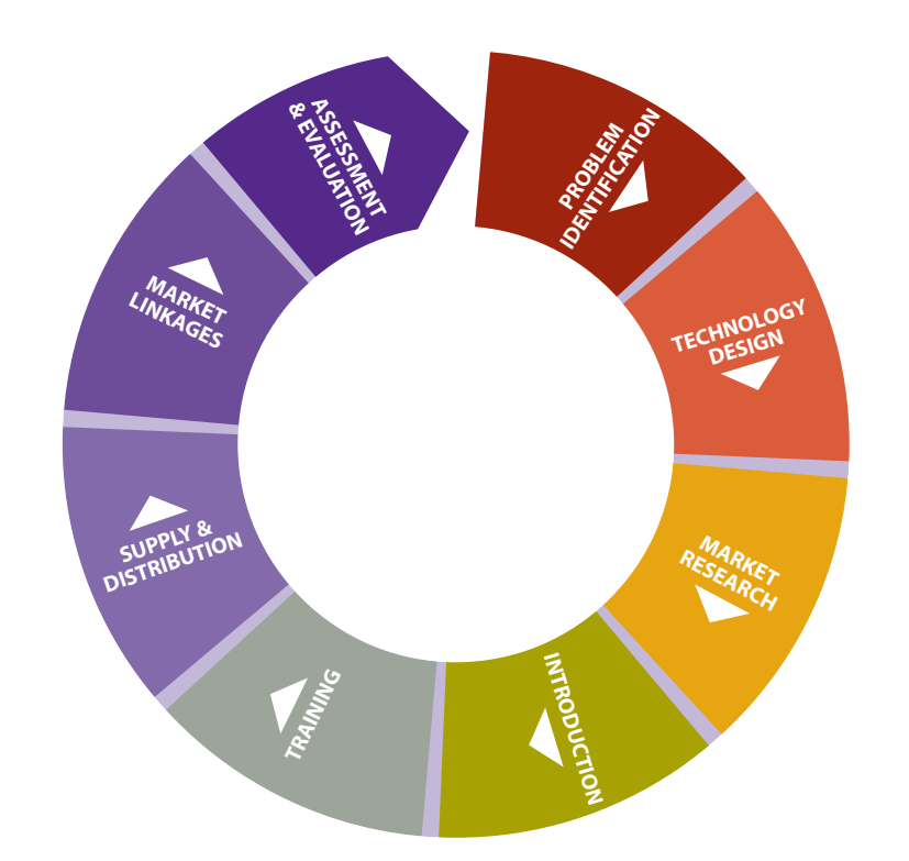
FIGURE 1: Technology lifecycle

These barriers are surmountable. Indeed, our research shows that technologies supporting women's economic advancement often do so by addressing (directly or indirectly) one or more of these barriers in a way that creates an enabling environment for women to access and use technology.