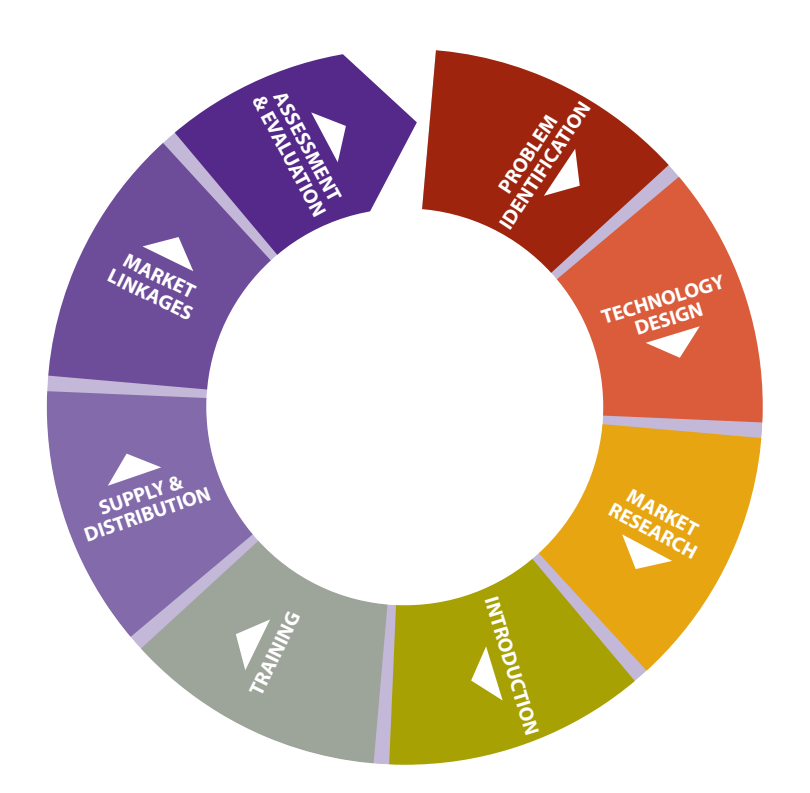
FIGURE 1: Technology lifecycle