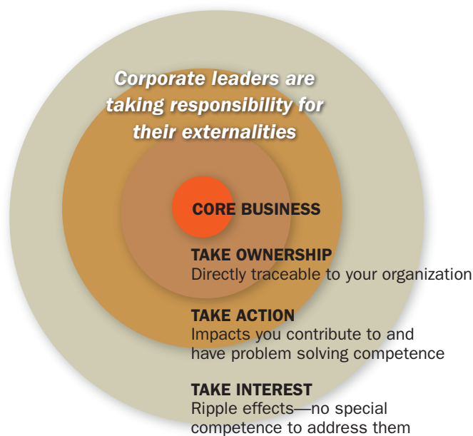
FIGURE 1 Ripples of Responsibility