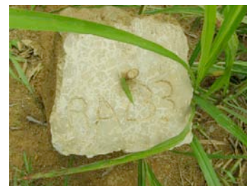
A bore hole to mark where AGA has been exploring for gold on Concession 40.