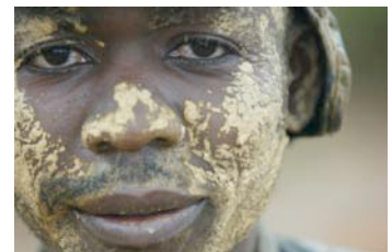
There are thousands of artisanal miners in Mongbwalu.

“ Mining is one of the most environmentally damaging industries in the world, creating huge amounts of waste and using toxic chemicals like cyanide to extract the gold from the rock. ”