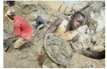
Artisanal mining is hard and dangerous work.

The Adidi closure is a good starting point for engaging with artisanal miners in Mongbwalu but when large scale operations begin, new challenges may present themselves. The number of miners facing displacement across the concession is