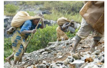
Backbreaking work: women carry sacks of crushed rock

A wide range of social impacts are associated with the prevalence of artisanal mining, such as drug use, alcoholism, and prostitution. 87 According to a report by PACT-Congo, the presence of artisanal mining has led to an increase in sexual and gender based violence, with Mongbwalu having the highest rate of such violence in Ituri. 88 There is also a widely recognised link between artisanal mining and HIV and AIDS.