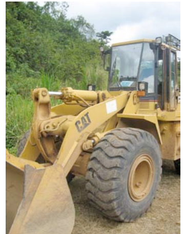
An AGK JCB at the former Adidi mine, Kilo

This research does not claim to be a comprehensive survey of local opinion, but highlights some of the potential impacts of the proposed Mongbwalu mine and the steps which AGA and the government should take to manage them. We hope this report will serve as a resource for people living near to the mine, and inform discussions between AGA, the DRC government, civil society and local communities about the mine's development.