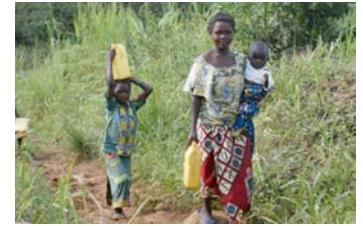
Local people say they have very limited information about the mining project.

This report makes a series of recommendations to AGA, OKIMO (L'Office des Mines d'Or de Kilo-Moto, the state gold-mining company) and the DRC