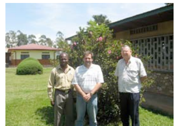
Mining experts from the Bench Marks Foundation and CAFOD.