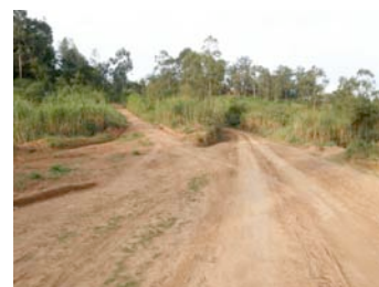
The Bunia to Mongbwalu road has been improved by AGA and MONUC

"We [AGA] will strive to contribute to the economic development of host communities through procurement activities;...assistance in the establishment