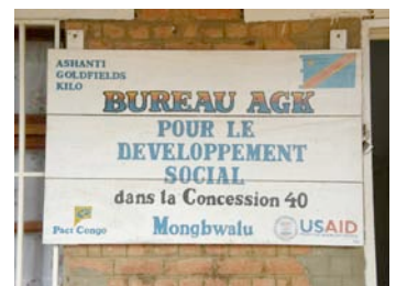
AGK’s Social Development Offices in Mongbwalu town

However, while it is positive that AGA is already engaged in social development, there is a feeling among local people in Mongbwalu that the level of social investment by the company to date has not been sufficient to really address local needs. AGA pays US$2,000 per month to both the local school and hospital 127 but school teachers told CAFOD that its contributions do not provide them with enough money to buy food for their families and is no more than a “drop in the ocean”. 128 In the hospital, this sum has to be divided between 62 workers, 129 meaning that an experienced nurse might receive only US$30 per month and a hygienist as little as US$10-15 per month, less than US$1 a day. 130 Staff also said that there are very limited medical supplies and equipment available.