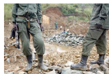
Struggle for control of mineral resources has served to drive conflict in DRC.