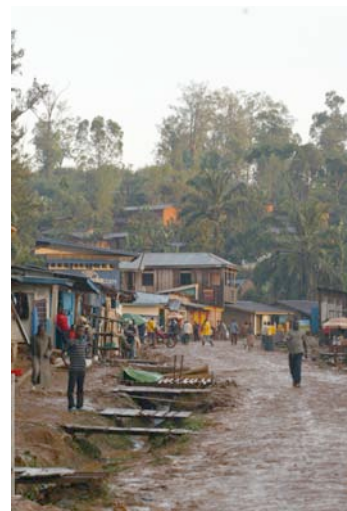
Mongbwalu town: in desperate need of investment

Another challenging legacy is that more than 1,000 local people lost their jobs with KIMIN when AGA became the new joint venture partner in Mongbwalu. As a result of these job losses, there has been an ongoing dispute between the former KIMIN workers, AGA and OKIMO, which continues to be a major source of tension. 115