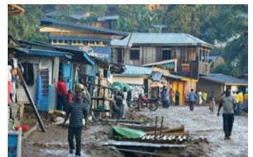
Despite DRC's mineral wealth, the majority of people live in abject poverty.