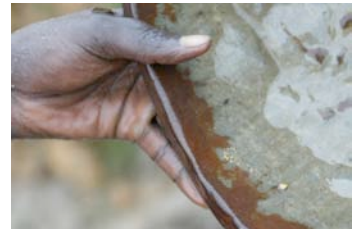
Artisanal mining: hours of hard physical labour for often small rewards.