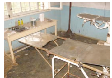
A room in the Mongbwalu Clinic