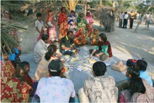
Testing images with community in Bangladesh.

As part of the ECB (Emergency Capacity Building) project, Oxfam GB designed a series of communication materials to be used in communities. The ECB is a network of NGOs who work together to improve the speed, quality, and effectiveness of the humanitarian community to save lives, improve welfare, and protect the rights of people in emergency situations.