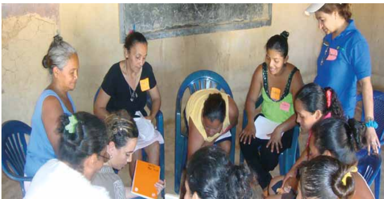
Community feeds back on Oxfam's accountability, Somotillo, Nicaragua

Adapted from 'Save the Children's video 'Setting up a Complaints and Response Mechanism'. Please use in conjunction with OGB Public Complaints Policy and Guidelines for Implementing Oxfam Public Complaints Policy in the International Division.