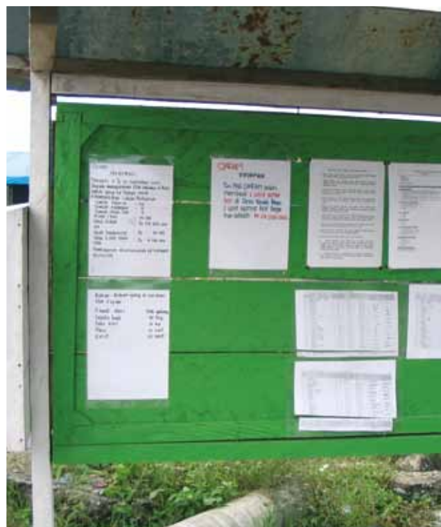
Information board at Manmota, Indonesia