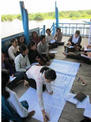
Women in Philippines HACCP prawn processing plant.