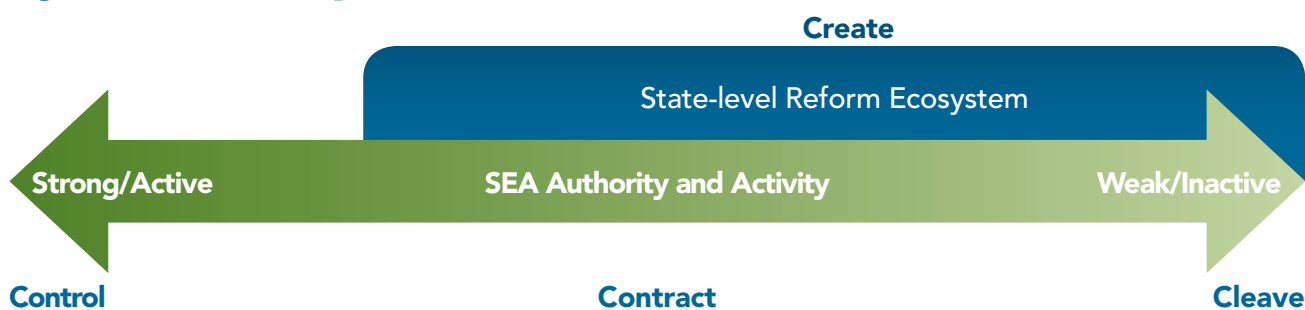
Figure 3. SEA Authority and the 4Cs

Instead of doing “more, better,” tomorrow’s SEA should do “less, better.” The SEA must empower the field rather than trying to unilaterally lead it. 68 Let’s look at how this approach might work in practice.