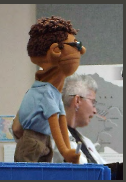
Bob the "blind" puppet

with colored powder that sticks to the places where bacteria have gathered.