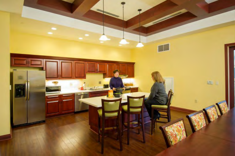
Left: Ames Family Hospice House great room Right: Ames Family Hospice House family kitchen