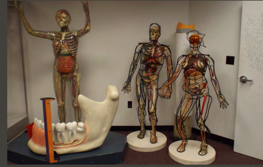
Skeletal display, Cleveland Museum of Natural History

Because health is "ever-evolving," the content of classes and the methods used to present it have to change, too.