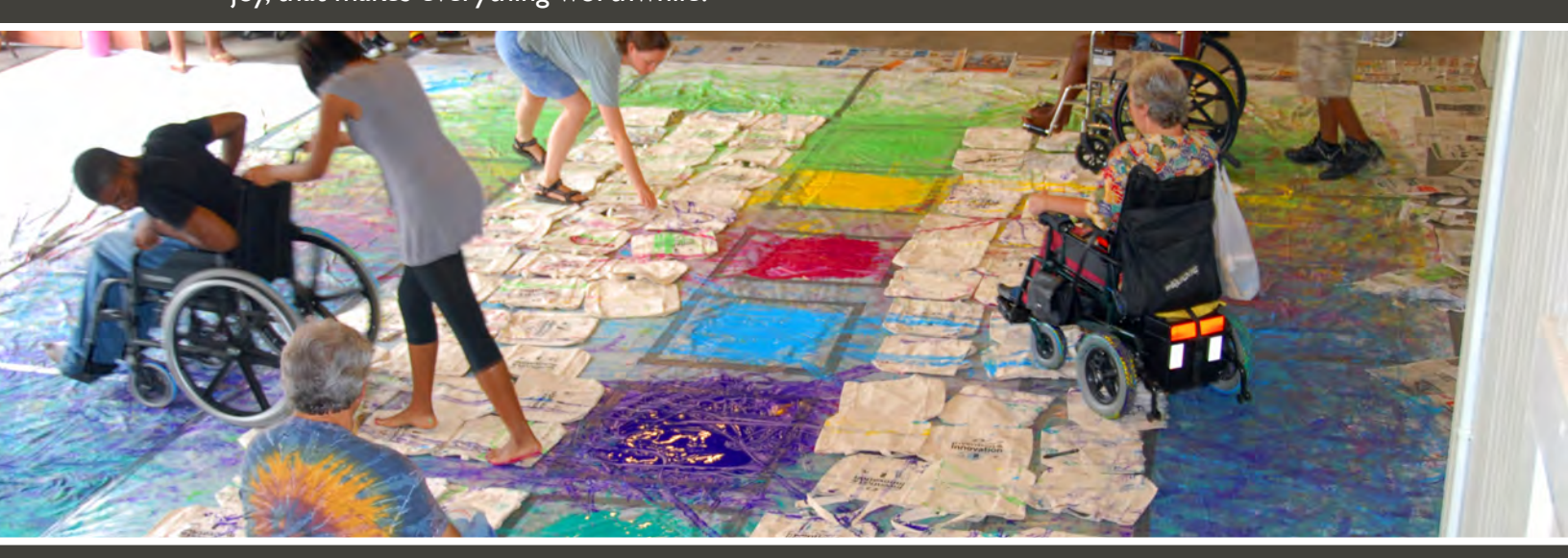
WheelArt – Wheelchair artists roll through colorful pools of paint to create unique designs on fabric using their wheels as paintbrushes.