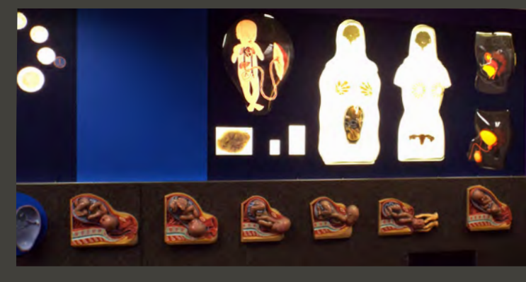
Reproductive system display, Cleveland Museum of Natural History