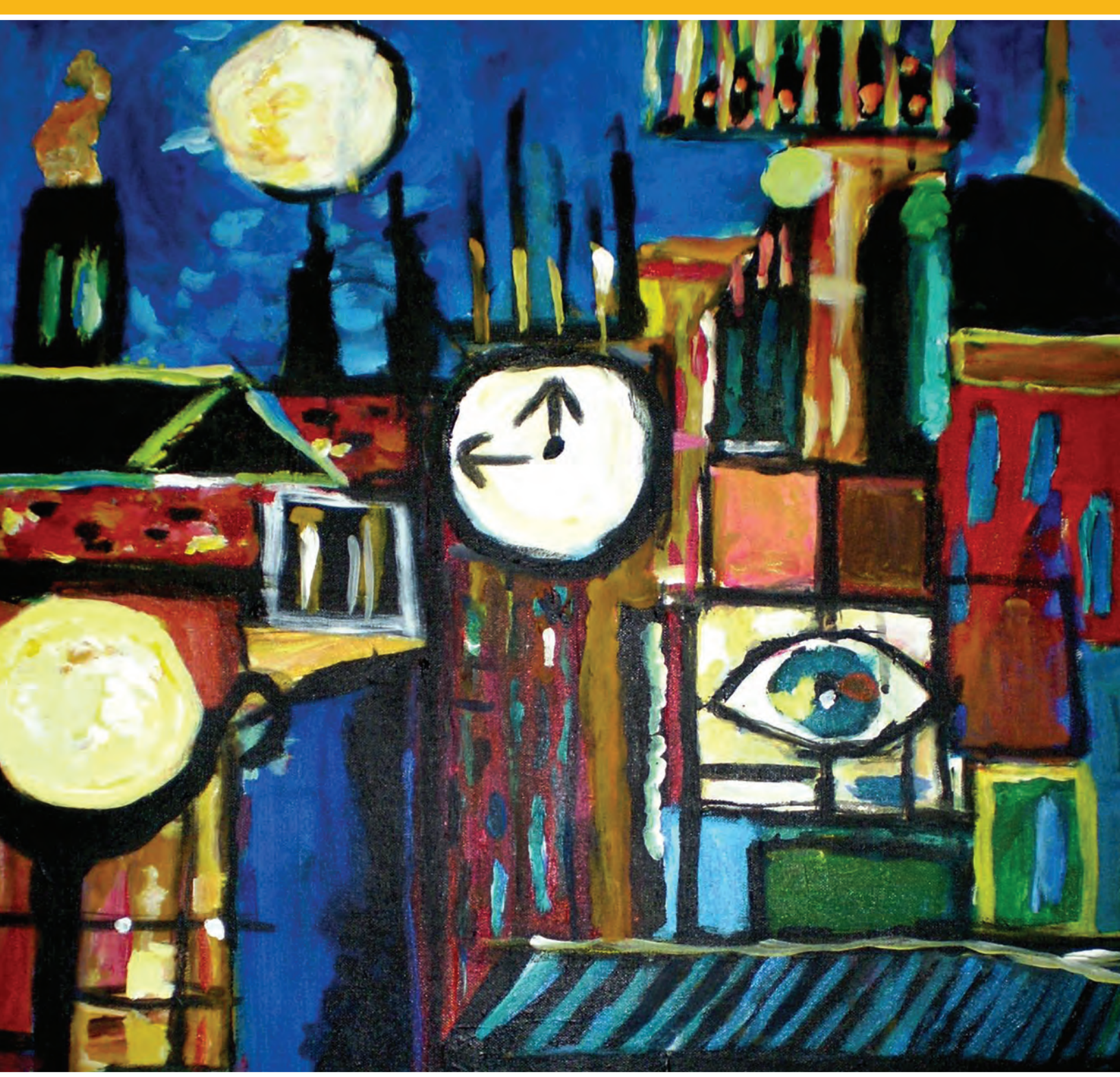
"CityScape" by Scott Mars, a participant in the Art Therapy Studio's community art program Photo courtesy of Art Therapy Studio