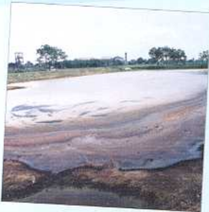
The pollution in Nandinar beel not only posed a threat to the resources and the livelihood of fishers, but to their health as well.

The key role played by local NGOs in the project highlighted the need for well motivated and highly skilled staff. Contrasting experiences with the same partner NGO illustrate this point. In Chapandah and Atrai beels in North-West Bangladesh, the CBOs have been very pleased with one of our partner NGOs role as it provided support not only in CBO management, but also in other areas of community support - micro-credit, Non Formal Primary Education (NFPE), health, sanitation. On the other hand, in Nuruil beel (Bogra), the same NGO failed to provide adequate support to the CBO to address local conflicts between two villages both of which severely impacted project implementation in the area.