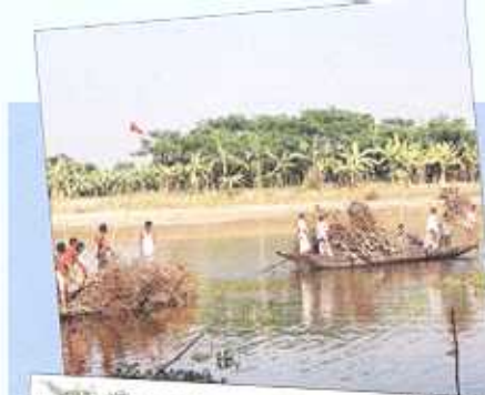
Katha is a fishing device made by placing tree branches in water bodies to attract fish which are then caught in an enclosing net. It causes conflict between small-scale fishers and Katha owners (mostly non-fishers) regarding who is entitled to catch fish.