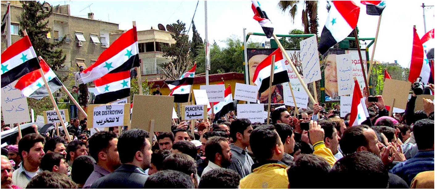
ANTI-GOVERNMENT DEMONSTRATION IN DOUMA ON APRIL 8, 2011.