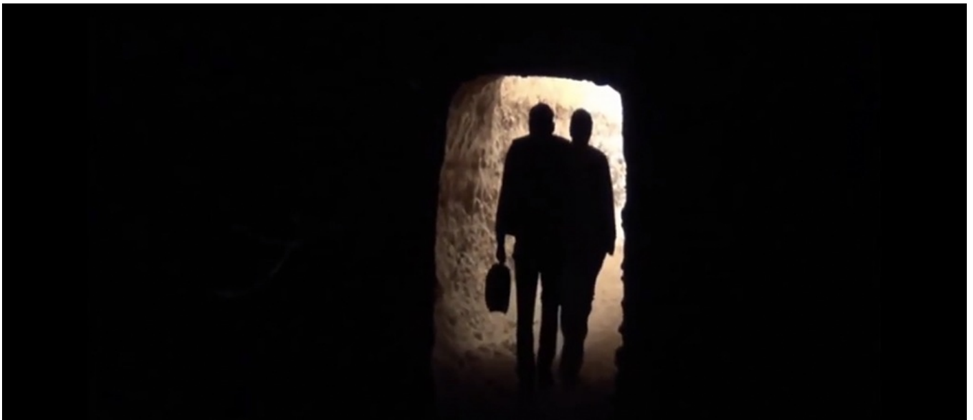
REBELS EXIT A TUNNEL IN THE EASTERN GHOUTA.

Apart from the Wafideen Crossing, the Eastern Ghouta has been supplied through a system of secret tunnels and semi-informal frontline crossings. While the crossings can bring in a far greater volume of trade, the tunnels serve to import goods that are restricted or banned by the government (including fuel, medical supplies, and arms), to move people in and out of the enclave, and to challenge and undercut food prices set by the Wafideen monopolists. Several different factions have had access to tunnels, but much of the traffic has also taken place in collaboration between two or more groups, sometimes leading to ideologically awkward alliances. Repeated battles between opposition groups erupted from 2014 to 2016 over profit sharing, charges of price dumping, and, more straightforwardly, over who should control which tunnel. Though the scope of the traffic may be less than many would believe, the tunnel trade has therefore emerged as an emblematic symbol of rebel corruption to many activists in the Eastern Ghouta.