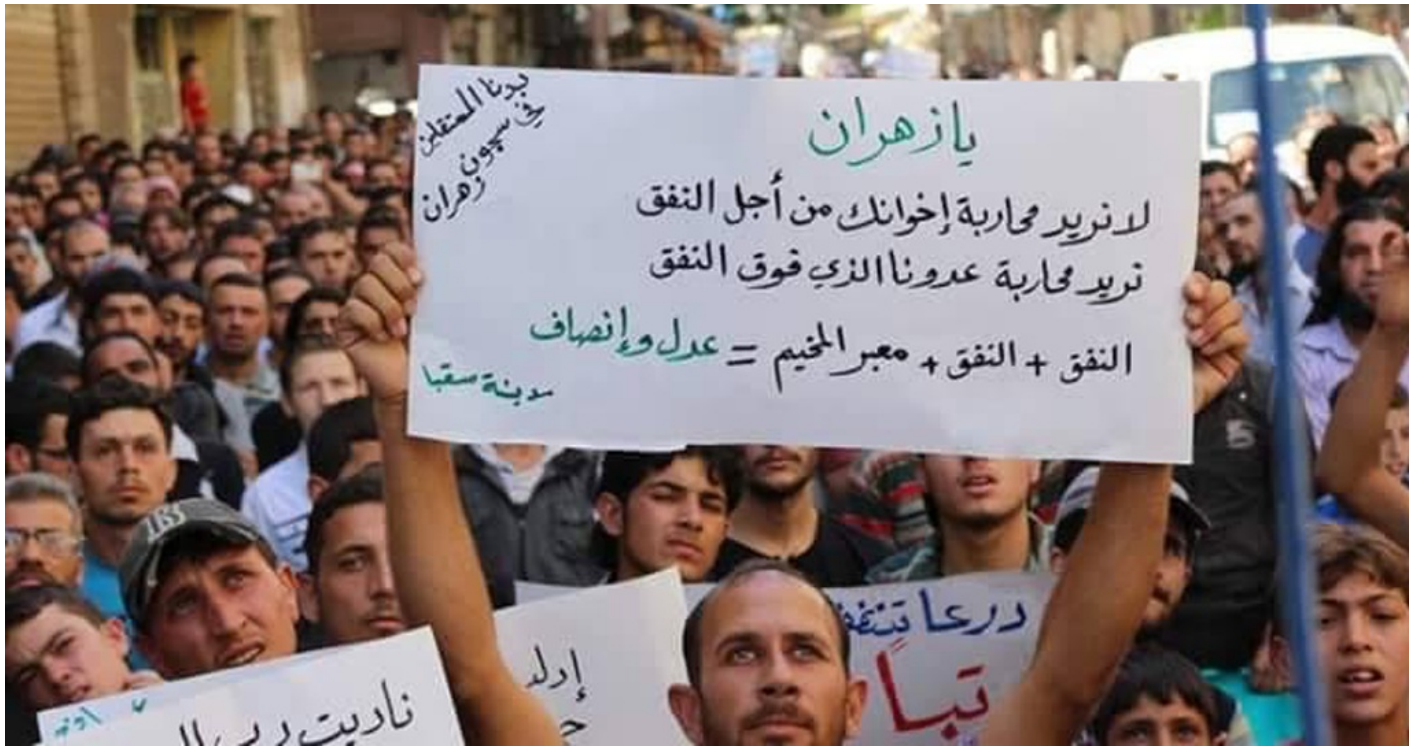
PLACARD HELD BY DEMONSTRATOR IN SAQBA IN AUGUST 2015.