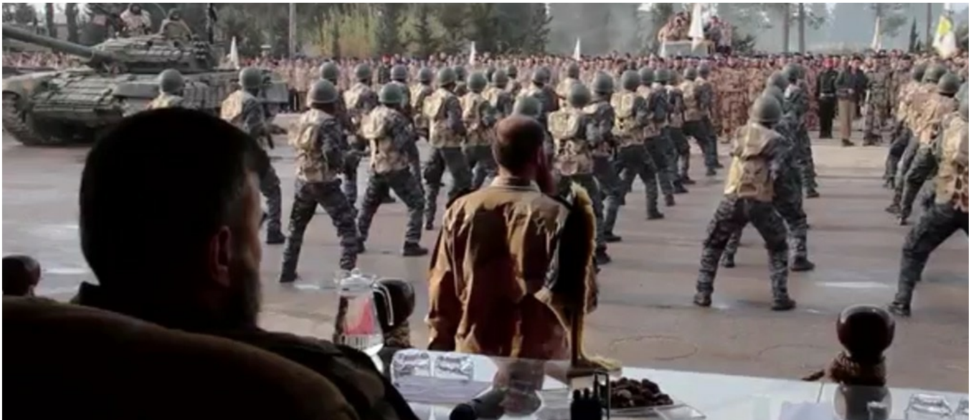
SEATED ON A PODIUM, ZAHRAN ALLOUSH WATCHES ISLAM ARMY FIGHTERS AND ARMORED VEHICLES PARADING THROUGH THE EASTERN GHOUTA, 2015.

After Zahran Alloush took his regional circuit in summer 2015, the Islam Army publicly endorsed the United Nations-led peace process, known as Geneva III. Failaq al-Rahman and Afnar al-Sham did the same. Islam Army representatives then participated in a major opposition meeting in Riyadh in December 2015, in preparation for the talks. 158