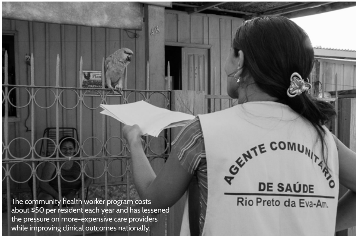
The community health worker program costs about $50 per resident each year and has lessened the pressure on more-expensive care providers while improving clinical outcomes nationally.

Moreover, the U.S. Department of Labor recommended a standard occupational classification of CHWs in 2009. This classification establishes CHW as a profession, securing workers' rights and professional standards. The involvement of professional associations such as the American Academy of Family Physicians and the American Public Health Association would provide a firmer foundation for wider use of CHWs, providing advocacy for CHWs and helping to integrate them into the workforce. States with Medicare Pioneer ACOs that are primed to adopt CHWs could be an ideal place to pilot the FHS model.