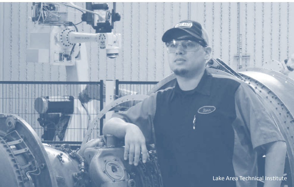
Lake Area Technical Institute