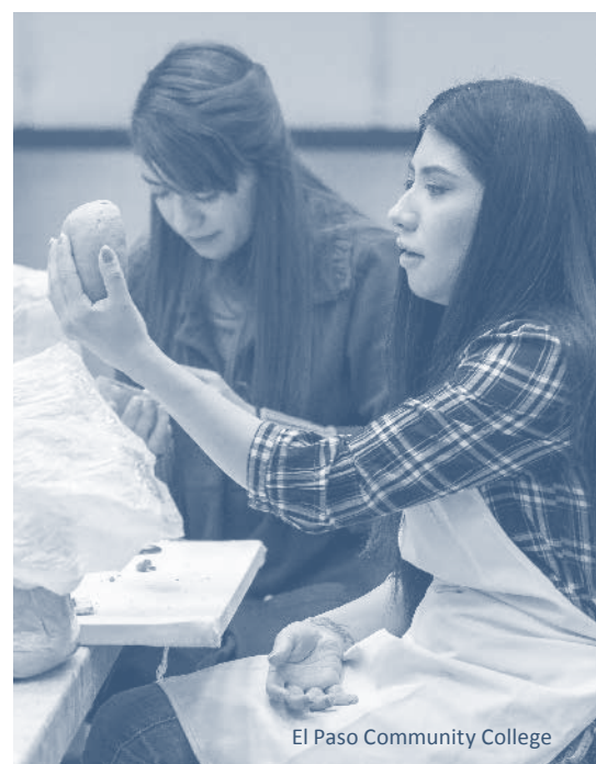
El Paso Community College

Having set goals and established measures against which to benchmark progress, colleges have to also be committed to evaluating progress regularly and revising strategies as needed to ensure that the impact of all student success reforms are, indeed, equitable. Leaders should not assume that reforms will impact all students equally and