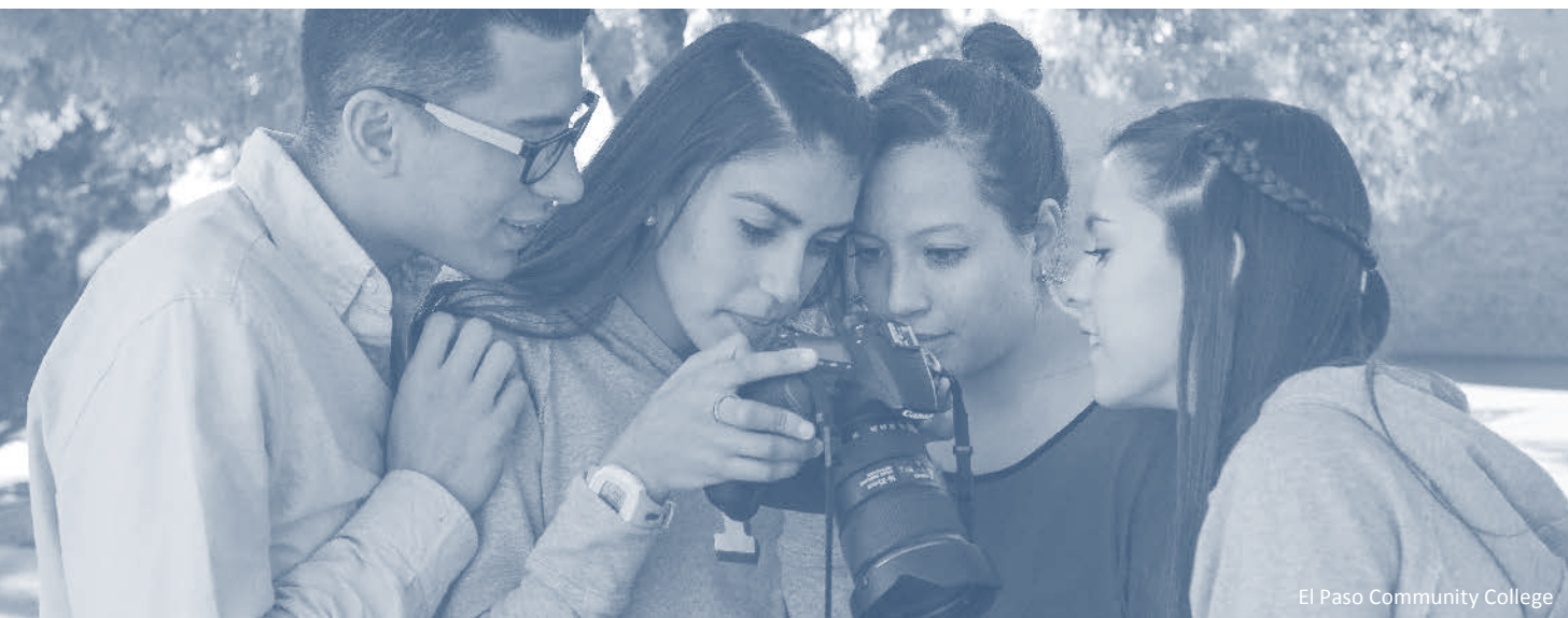
El Paso Community College

The college "adopted" its third elementary school this year—and by adopting, they contribute $10,000 to the school to bill it as a "college-bound elementary school." Students receive T-shirts that say "Future College Student" and backpacks; educators and support personnel are asked to display their college degrees in their classrooms and offices; and third grade is referred to as the high school graduating class of 2025 and college graduating class of 2029, for example. The college also buses students to the nearest of its five campuses for tours and other events.