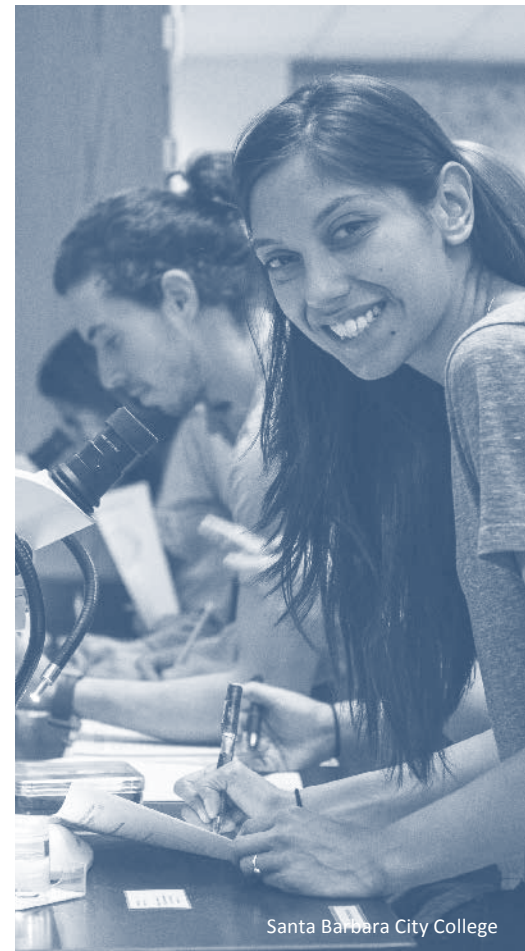
Santa Barbara City College