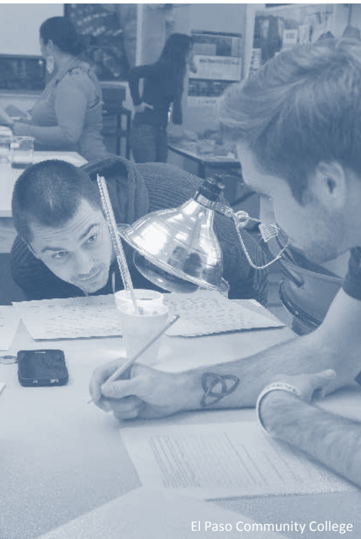
El Paso Community College

The most effective community colleges understand themselves as just one stop in a larger educational trajectory for students. They enact that philosophy by creating connections to other sectors in order make that trajectory seamless. While the approaches featured in this report vary based on student needs and local contexts, they are all cemented in the notion that pathways from high school through higher education and into the workforce require robust, cross-sector partnerships that contribute to more equitable postsecondary education outcomes. To be sure, internal reform strategies like those mentioned above are critical for advancing student outcomes. But external partnerships are equally vital as cornerstones of structural equity —policies and practices that eliminate chances for students to fall through the cracks before they arrive and after they graduate.