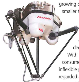
▲ Figure 1: The ABB FlexiPicker is a high-speed vision-controlled robot (3)

Automated solutions are at the tip of everyone's tongue at the moment. But there's a lot of spin going on, and sometimes it's difficult to work out the real benefits. Venketesh Dubey, Bournemouth University, gives his perspective.