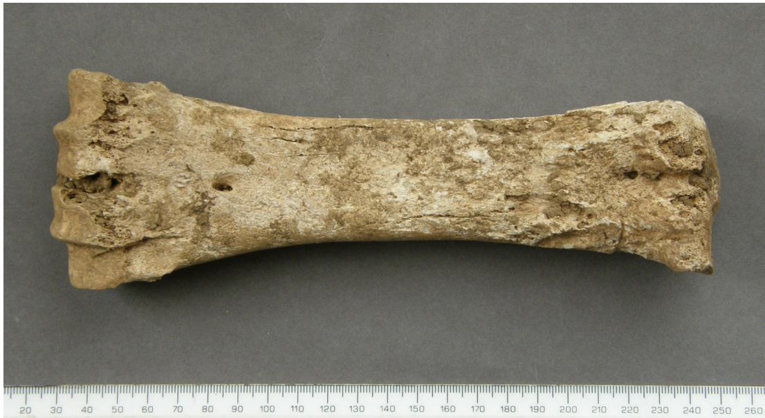
b) posterior surface