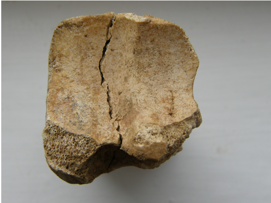
a) proximal articular surface