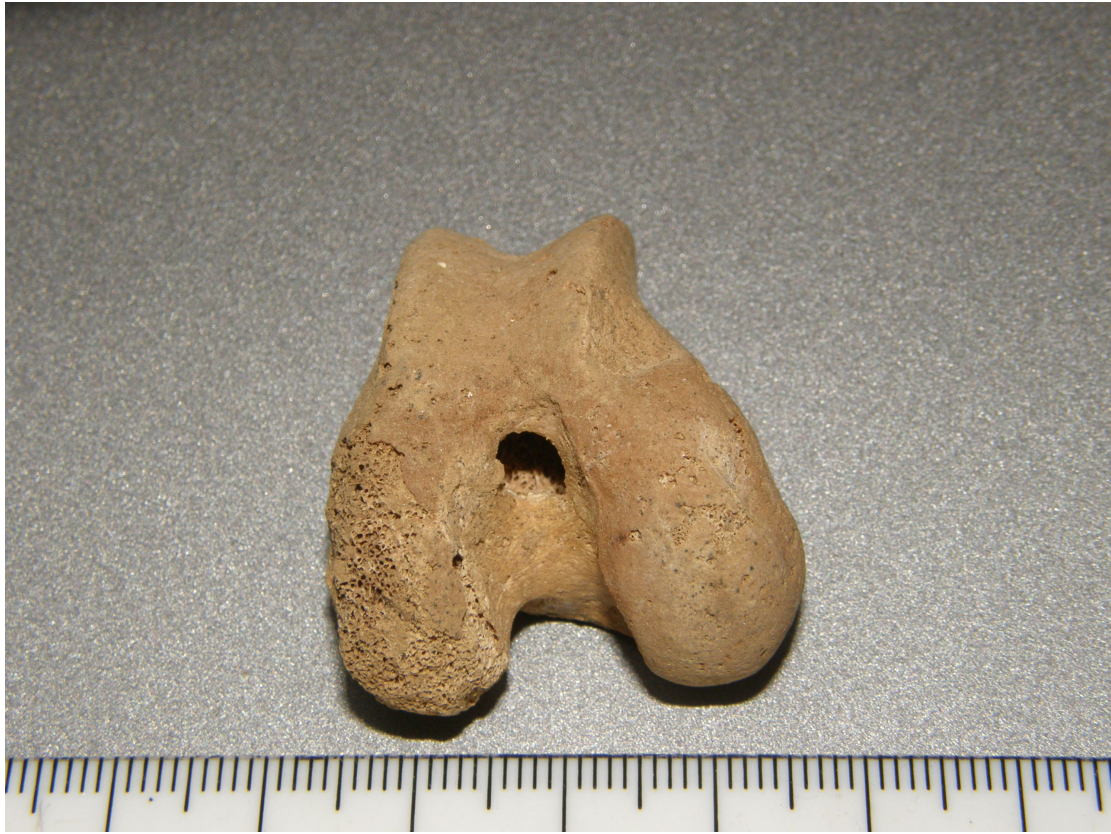
Figure 2: Distal epiphysis of sheep femur exhibiting pathological lesion