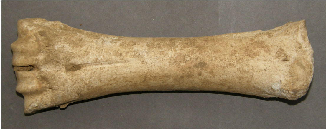
a) anterior surface