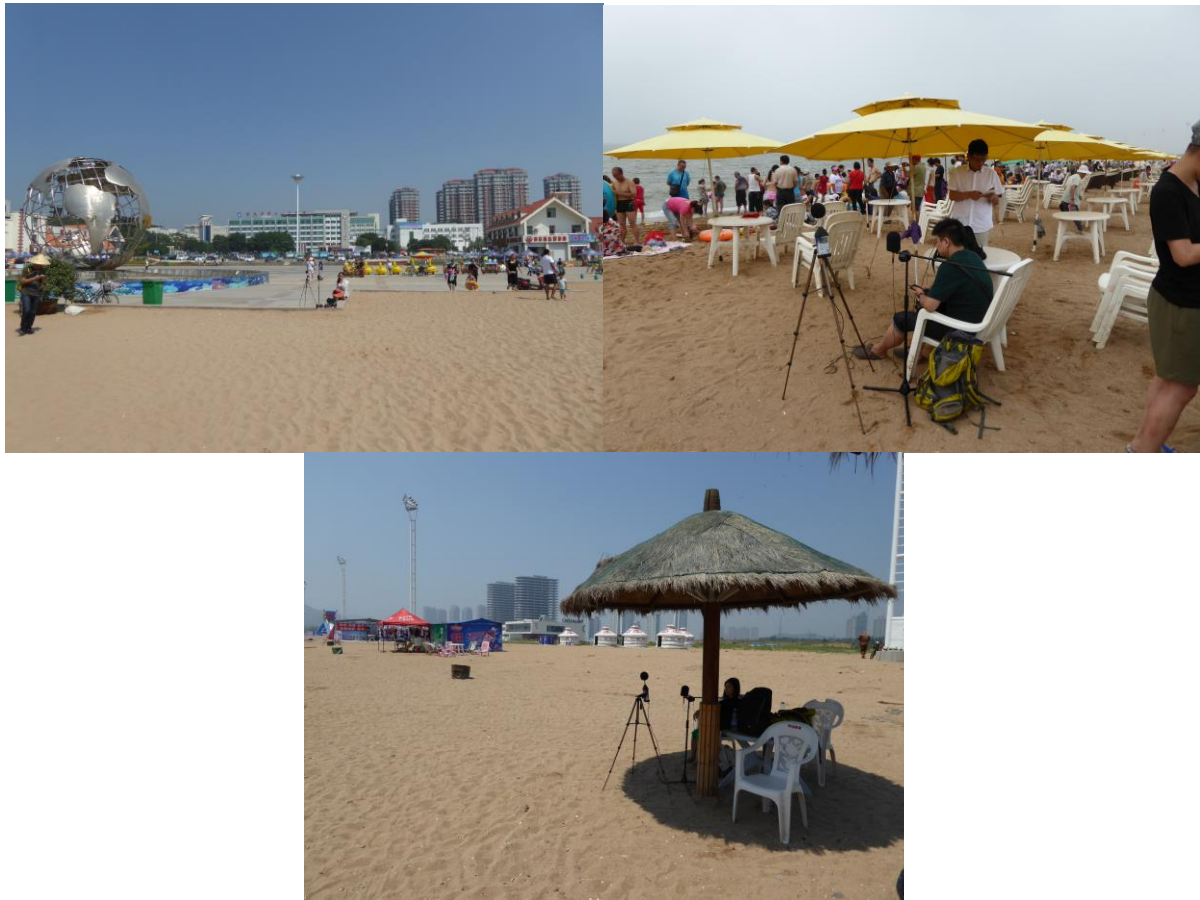
Figure 2 – Investigated sites in Huludao: square near the beach (top left), populated part of the beach (top right) and less populated part of the beach (bottom).