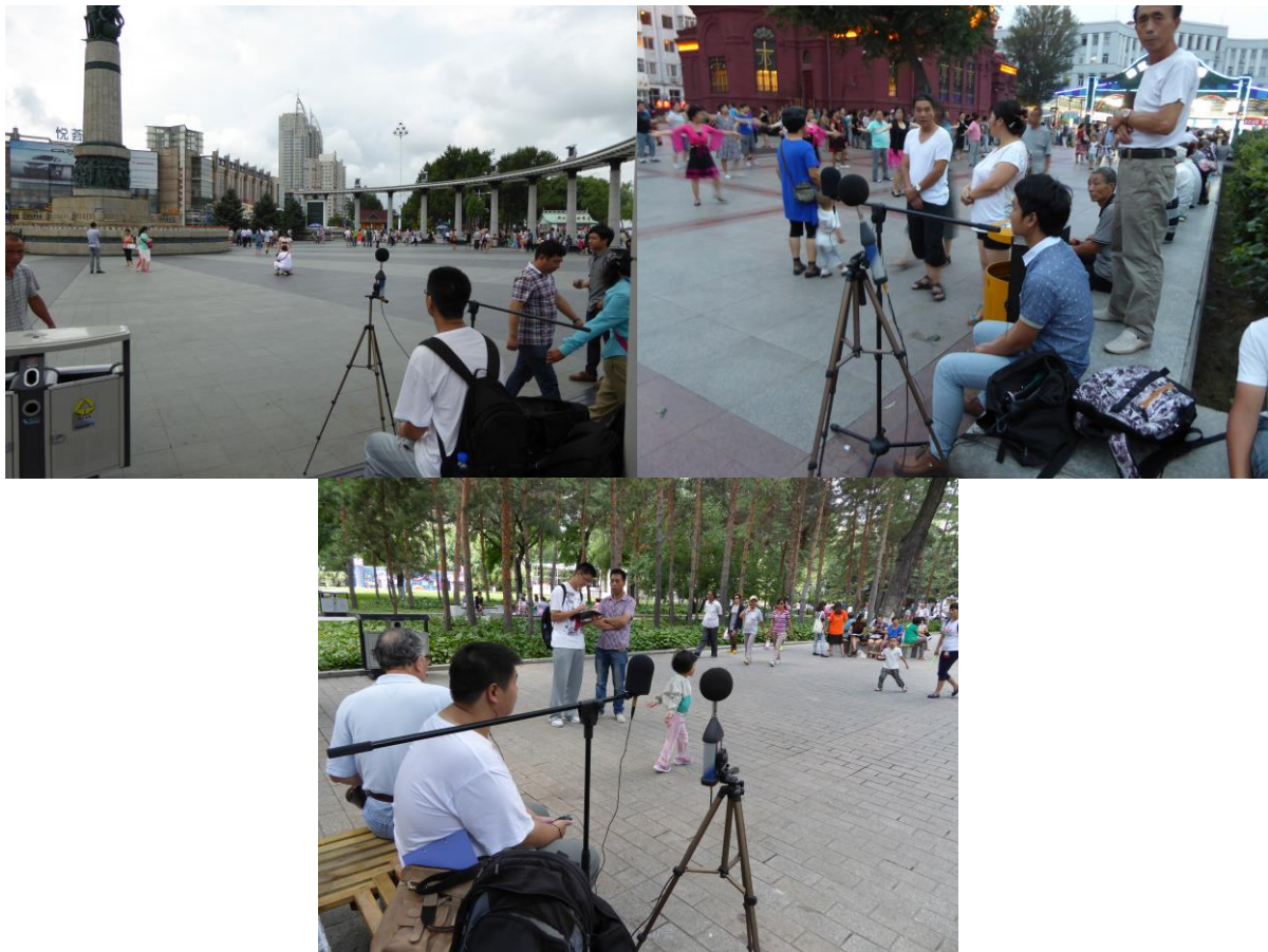
Figure 1 – Investigated sites in Harbin: Stalin park (top left), Citizen square (top right) and General park (bottom).

The survey and recording sites in Harbin were: Stalin park, Citizen square and General park (Figure 1). Recordings and surveys were conducted in Huludao in the following sites: in a square near the beach, in a populated part of the beach and in a less populated part of the beach (Figure 2).