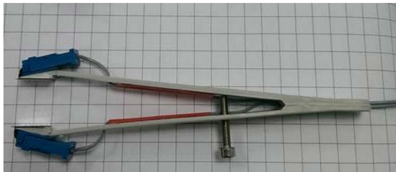
Figure 2. Completed device showing electrical connections and stopper screw.

Based on testes measurement as outlined above, arrays of 5 x 4 needles were used. Needle height was 500 \mu m, pitch was 1725 \mu m, and the array base measured 8.62 mm x 6.90 mm. To generate prototype electrodes, arrays were affixed to the flat tips of plastic tweezers (Lerloy 6, Farnell, Ireland) using double-sided tape, and interfaced to a voltage source with ribbon cable and wire-to-board connectors. A stopper screw was added to the assembly to limit electrode travel and provide a consistent application force, Figure 2.