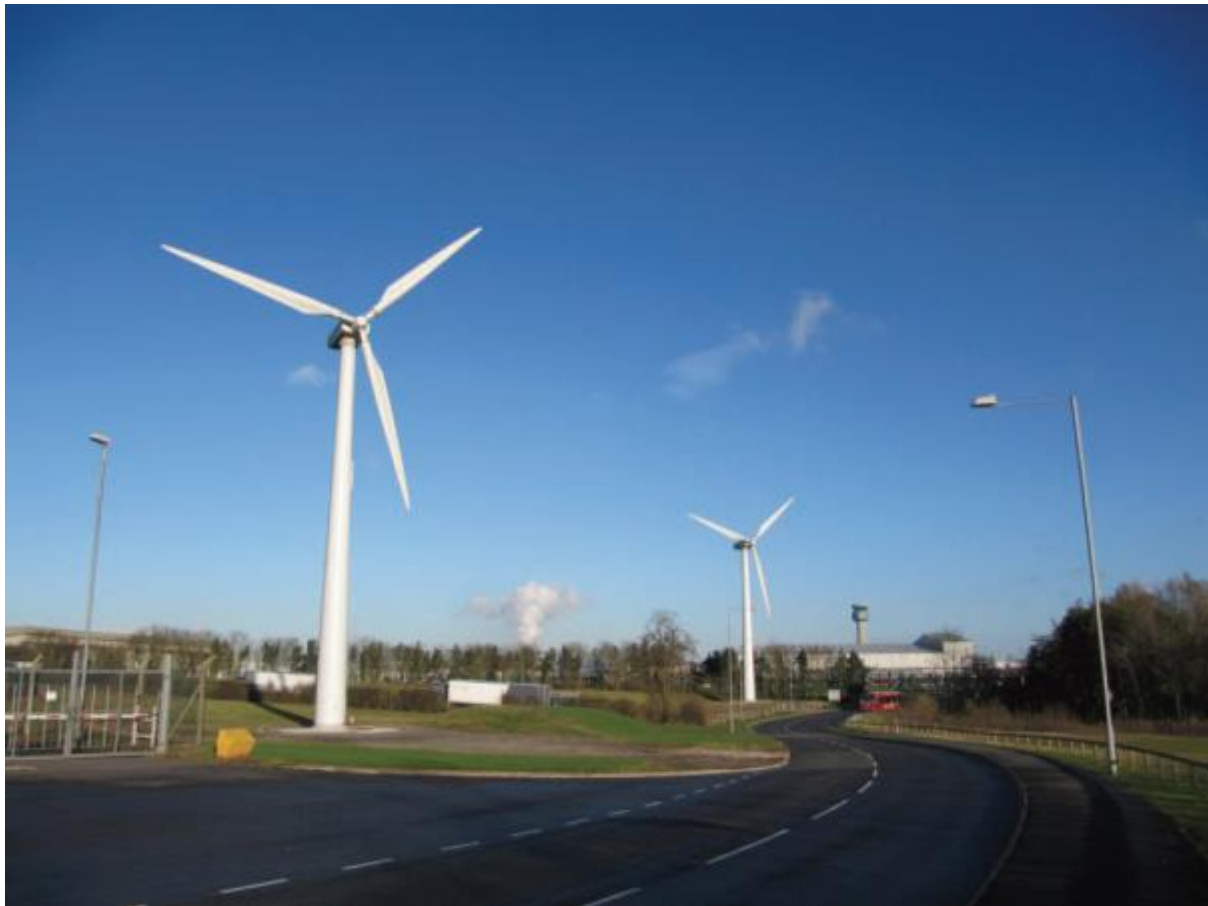
Figure 1. Wind turbines at East Midlands airport

technology more widely stems from safety concerns about the height of turbines relative to aircraft movements as well as their possible effects on radar systems (Tennant and Chambers, 2005).