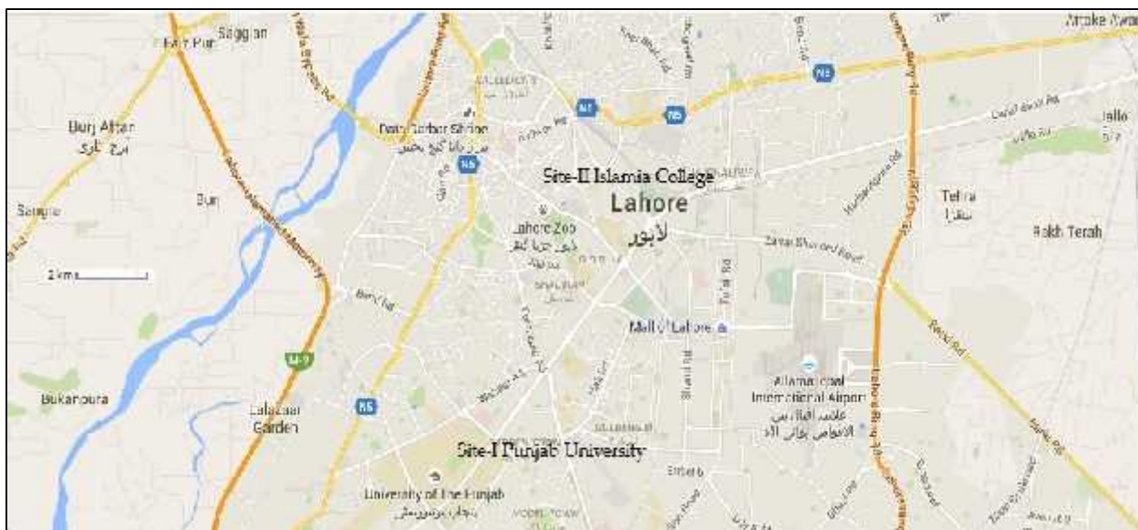
Figure 1. Location of site-I and site-II in the Lahore

There were traffic within the university mainly buses run by university and private student/staff cars, composing and printing shops, cafeterias and laboratories in surroundings of sampling locations.