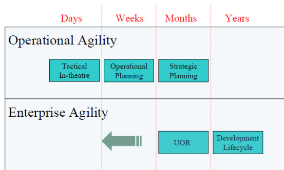
Fig 3. Operational and enterprise agility timelines [11]

It is essential that the current Enterprise Agility Profile (EAP) be assessed to demonstrate that it proves sufficient to deliver the required operational agility, and therefore satisfy CNs 4 and 5. Where this is not the case, CN 6 for a more rapid or agile process (i.e. a UOR-type activity needs to be accomplished in weeks rather than months as shown in figure 3), or at least more agile activities, is required.