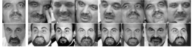
Fig. 2: Top: A testing image and 7 training images from LFWCrop. Bottom: A testing image and 7 training images from UFI.

We assessed the efficacy of our approach for face identification in unconstrained conditions using the cropped Labelled Faces in the