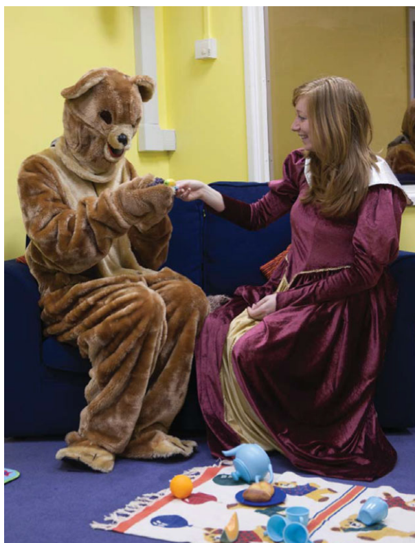
Figure 1 Birthday lady and teddy bear. [Color figure can be viewed at wileyonlinelibrary.com ]