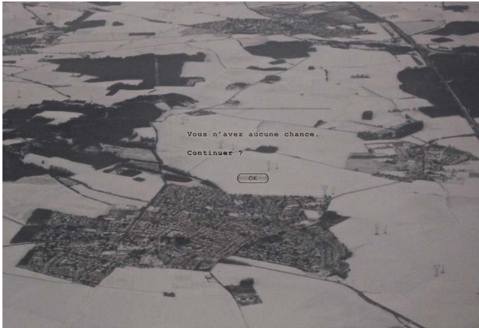
Fig. 1. Mission #001

© Michel Houellebecq. Courtesy of the artist and Air de Paris, Paris. (Part of Carré de Baudouin Press Release).