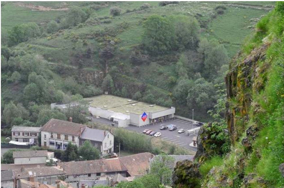
Fig. 2. France #01

© Michel Houellebecq. Courtesy of the artist and Air de Paris, Paris. (Part of Carré de Baudouin Press Release).