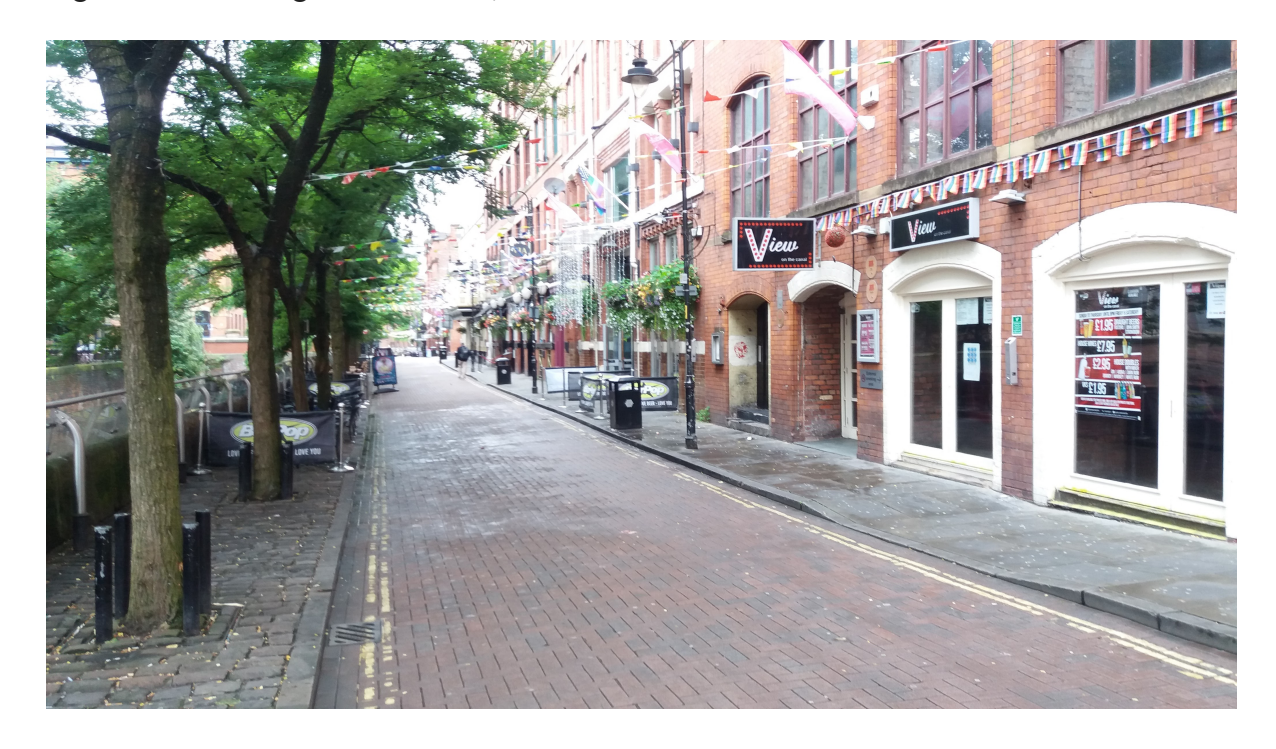
Figure 1: The Village © the author, 2016