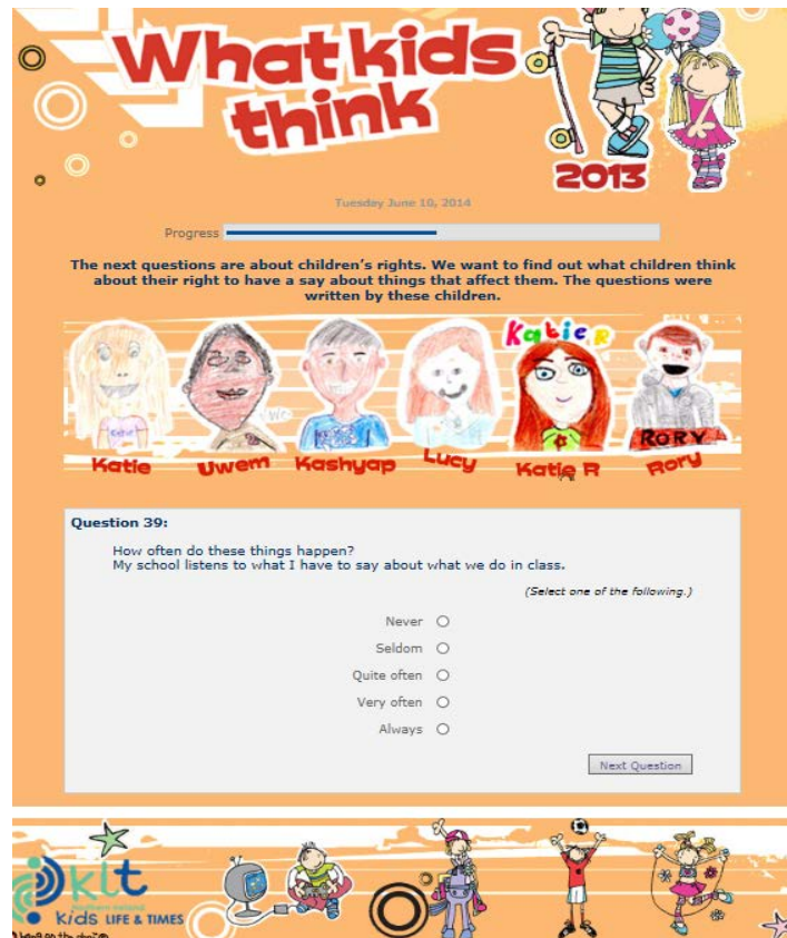
Figure 3: Screen-shot of introduction to CPRQ module

Thus the final items reflected not only the core elements of a rights-based approach to participation but also the lived reality of the realisation of this right for children in context. Further, the items were articulated in the authentic, and easily understood, language of children. This could not have been achieved without the involvement of the CRAG.