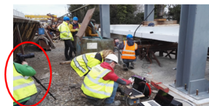
Figure 2: Camera Location

Figure 1 shows a picture of the test rig. Three linear variable displacement transducers (LVDT) were placed at the mid-span section, one in the centre and two at the edges. Two additional analogic displacement transducers were placed at about 800 mm from the edges to be able to clear the mid-span deflection from the shortening of the timber slats. A manually controlled hydraulic pump provided with an analogic pressure gauge supplied the pressurised oil to the ram. A Nikon 810 camera was set up 6m from the beam to provide a means of determining the slab deflection using fully contactless methods, as shown in Figure 2.