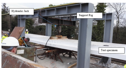
Figure 1: Testing Rig

A full scale experimental investigation was carried out at Banagher Precast Concrete Ltd, Co Offaly on a 10m long concrete floor slab which was prestressed with basalt reinforcing bars. The slab was cast on the 22nd of January 2016 and allowed to cure for over 40 days. The slab was then tested on the 16th of March 2016. The slab member was simply supported and the load is applied at mid-span by a +300 mm stroke mono-directional hydraulic jack counteracting on a strong steel reaction frame. A steel repartition box beam was placed in between the jack and the slab.