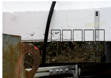
Figure 4: ROI Locations.

The data in Table 2 shows that an error still exists between the LVDT and camera based deflections, the most accurate calculated deflection was determined from ROI 3(the region directly above the LVDT), where a vision based deflection of 3.03mm was calculated eliminating the error. Based on this it was assumed that since the camera was not perpendicular to the test specimen the accuracy of pixel to mm calibration was inversely proportional to the distance between the ROI and the ruler. Further modifications were then carried out to attempt to minimise this error, the post processing algorithm was then adjusted to compensate for this by applying a normalisation factor to the x coordinates of the measured deflection points. Deflections from the 5 ROI were then recalculated and the results are presented in Table 3. The data in Tables 2 and 3 confirm that the tested method did not