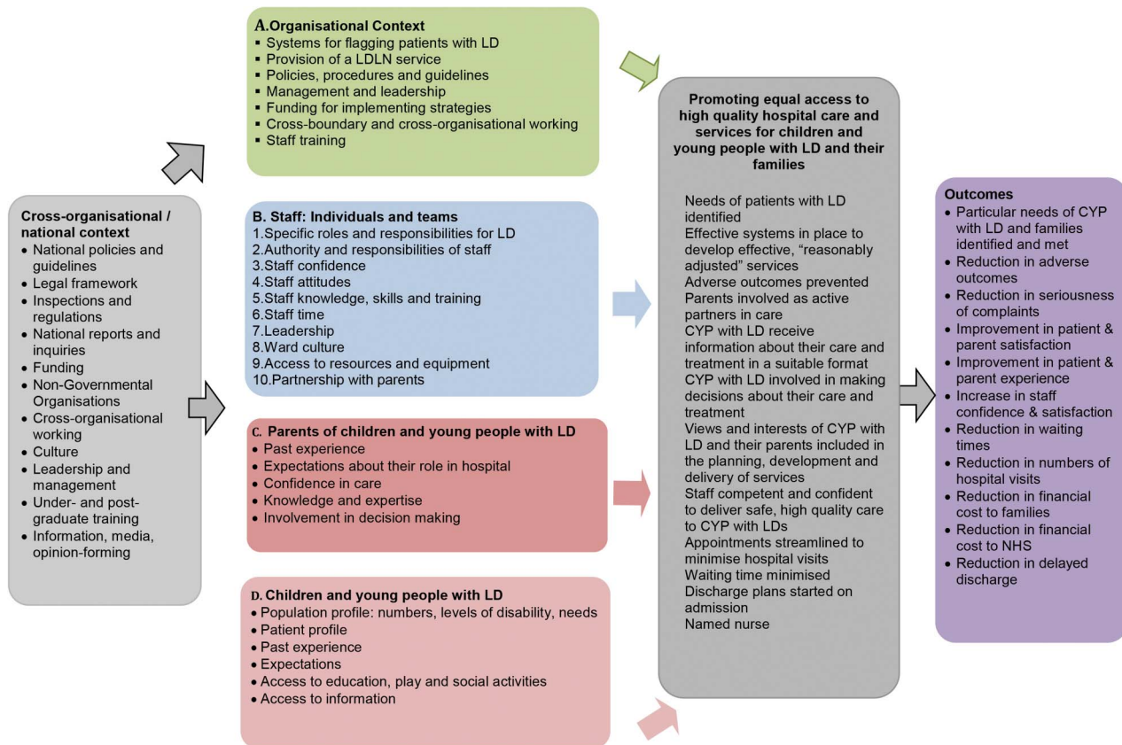
Figure 1 Theoretical framework.