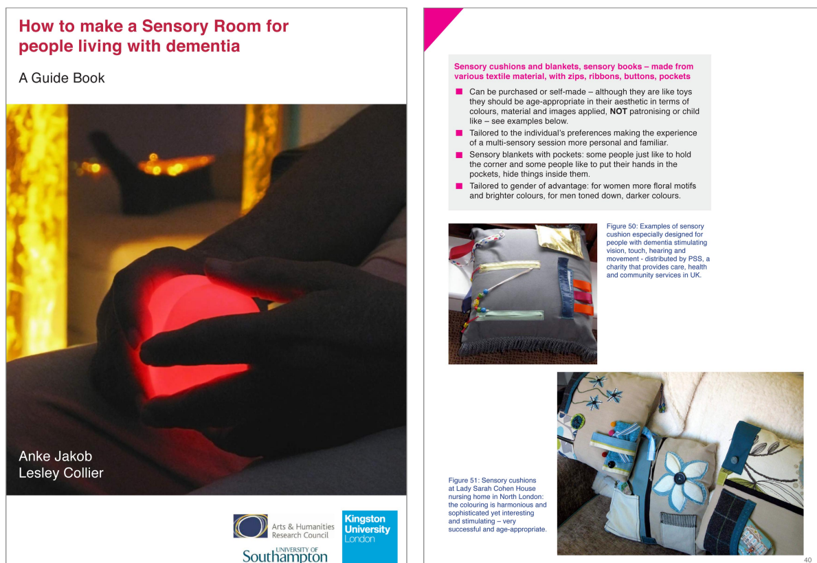
Figure 3: Pages from the Guide Book

Three undergraduate graphic design students from Kingston University were invited to collaborate on developing the design of the guide book. Requirements here were: clear and accessible, easy to navigate and well structured, yet inspiring and refreshing. This was achieved by applying colour coding for each heading making navigation easier and emphasising each theme, using a lot of images and limiting the text and written information, employing clear graphics and signs.