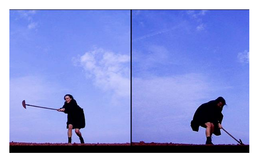
The work/toil section, Blind Torrent (2011).