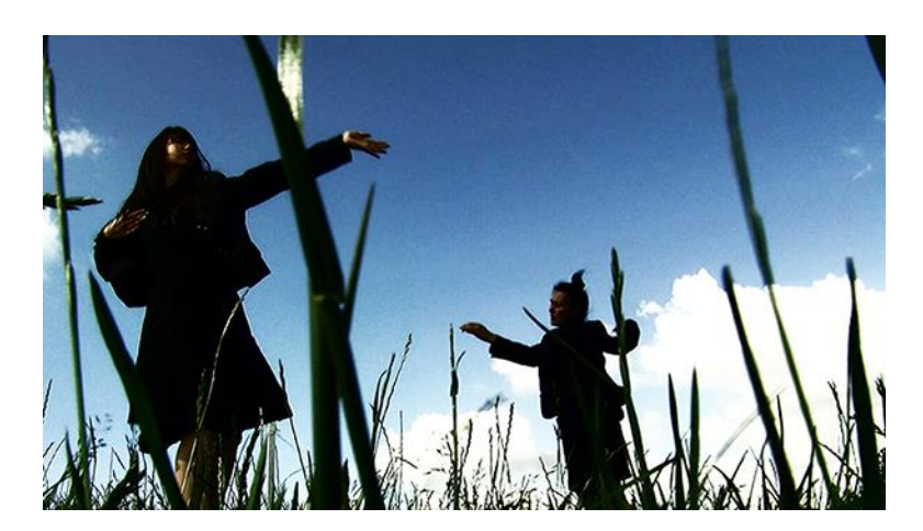
Blind Torrent (2011).

Blind Torrent is a screendance film, distilled from over 20 hours of filming, shot on location in the agricultural hillsides of Mid Devon and in the studio at Plymouth University. Filming took place from March 2011 – January 2012, to capture the landscape in different seasonal states. The title Blind Torrent refers to the unstoppable surge of a torrent, a torrent of information, an overflowing, flooding force, but a force that has no fixed outcome or destination. The concept of the torrent in this dance film acts as a metaphor for the evolution of both human consciousness and the increasing degrees of social and cultural complexity.