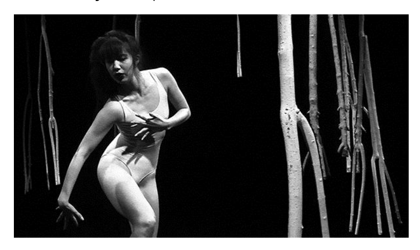
The sanctuary of bones. Blind Torrent (2011). Courtesy of Russell Frampton

The primary locations of the film are subdivided into four areas, each representative of a season. This alludes to repetitive natural cycles, and is a layer within the film that orders implied ritual activity and creates a distinctive cosmological structuring. The first environment created for the film was the 'sanctuary of bones,' representative of winter, a time of reflecting, taking stock and of preparation. The recurrent transitions into this space mark a descent from sky, to horizon and to land, where a slow descent into the 'underground' represents a sinking, a dropping down into an abyss. Victor Turner's explanation of the terms 'byss' and 'abyss' has pertinence in our attempt to describe the qualities residing in this environment, "Ritual, in other words, is not only complex and many-layered; it has an abyss in it." <sup>16</sup> Turner describes 'byss' as being deep and 'abyss' as beyond all depth and writes, "Many definitions of ritual contain the notion of depth , but few of infinite depth."