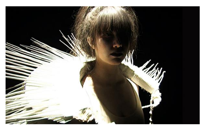
The collar, costume, Blind Torrent (2011). Courtesy of Russell Frampton

minute detailing of surface pattern. In a sense there is a direct connection to the landscape itself, as structures are often made from localized materials and found objects. These artifacts served to create forms whose physical properties were shaped by the land and mediated through the artist, examples being the ritual posts and the collar [see second and fourth images].