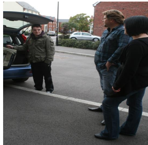
Child going away on holiday

Triangulation scenarios (triadic pictures) : The second set of pictures was taken from Smalley (2013). These included: Parents arguing over an inappropriate present for the child; Parents waiting up as the child comes home late; Mother/father listening in to child's conversation with the separated parent; Parents discussing the child's school report; Father leaving after an argument; and Mother leaving to have an affair. These pictures were designed to elicit understandings and emotional responses regarding typical triadic interactions and conflicts. Two sets of pictures were developed: with male or female children in the pictures to facilitate identification with the young people depicted.