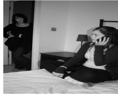
Child calling separated father – mother listening