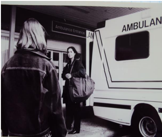
Mother Going Into Hospital