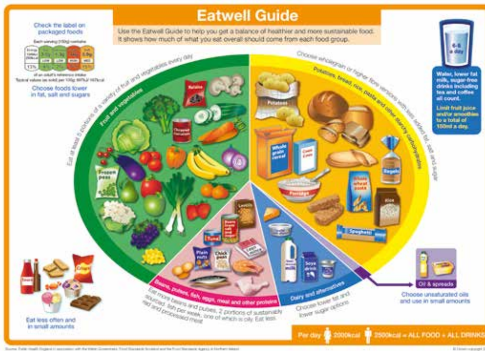
Figure 2. The Eatwell Guide, as recommended by the NHS and British government (Public Health England 2016).

All food provides us with energy, measured commonly in calories. A calorie is a unit of heat energy, or, more precisely, the amount of energy required to heat 1 gram of water by 1°C (at normal atmospheric pressure at sea level). The higher the calorific value per gram of food, the more energy there is available from that source (eg there are 9kcal/g fat, 4kcal/g protein, 3.75 kcal/g carbohydrate and 7kcal/g alcohol).