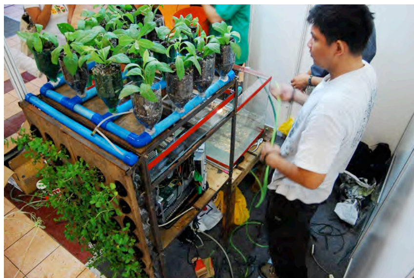
Figure 6. The learners’ independently-designed version of Biomodd

We found that most of the key contributions to the final [LBA 2 ] installation that set it apart from [ATH 1 ] occurred in phases 3 or 4. Indeed, it is in the process of trying out and attempting to build different solutions that insights occurred. With this mind, in addition to having learners work on the main [LBA 2 ] installation, we also asked them to design and exhibit their own version of Biomodd (Fig. 6).