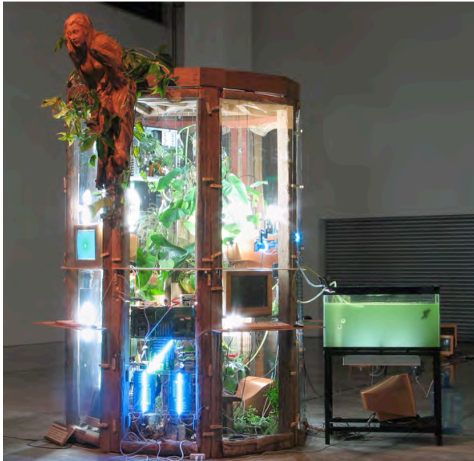
Figure 2. The Biomodd[LBA 2 ] sculpture

The hybrid relationships presented in Biomodd[ATH 1 ] were novel for the intellectual and cultural context of the UPOU learning community, and provided avenues for leveraging Biomodd as a springboard for learning. In 2008, UPOU partnered with Vermeulen to develop a course on new media art practice, Multimedia Studies 198 (MMS 198), based on the emerging Philippine version of Biomodd, which is now known as Biomodd[LBA 2 ]. The final physical form of [LBA 2 ] is shown in Fig. 2. Biomodd[LBA 2 ] clearly has some of the features of [ATH 1 ]. However, in addition to obvious differences in the materials used (e.g., the case is made of wood, not metal), the sculpture departs from [ATH 1 ] in significant ways, which we discuss in the next section.