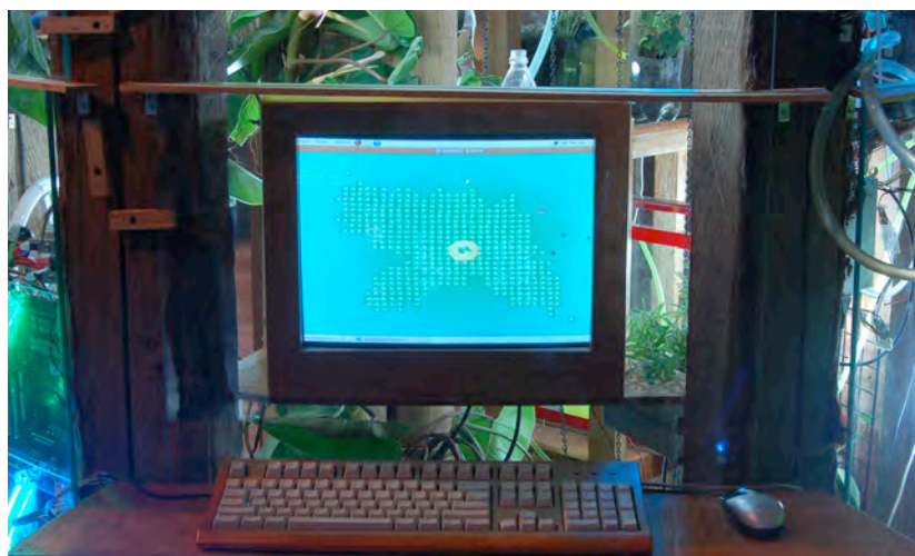
Figure 5. The Biomodd[LBA 2 ] game, inspired by Maria Makiling

A small team from within the group took up the challenge, and after many iterations of storyboarding, prototyping, and testing, they arrived at a poetic response. Biomodd[LBA 2 ] was largely built at the foot of a mountain in the Philippines called Makiling, in which a deity, named Maria, is believed by locals to protect the mountain from ecological decay. With this in mind, the team developed a game that requires players to work together to work with Maria to protect the mountain by planting trees and building walls that deter unspecified (but visually distinct) destructive forces from attacking the mountain. At the heart of the mountain is Maria, represented as an abstract avatar (Fig. 5).