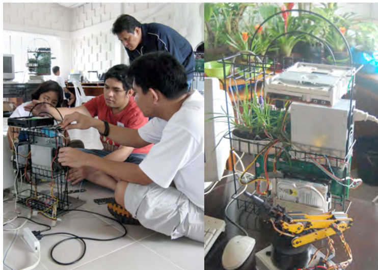
Figure 3. Case modding computers using shower racks

The ability to reimagine the physical form of a computer is a crucial skill that was necessary in assembling the final installation. One of the critical skills in any art form is being able to recognize and work with the affordances and limitations of the medium. For the final display, for instance, it was critical for the learners to understand how to mount computer components alongside biological components (such as plants, tropical fish aquariums, and algae-filled plastic tubing) in a way that would create a feeling of danger and precariousness, while actually being physically safe.