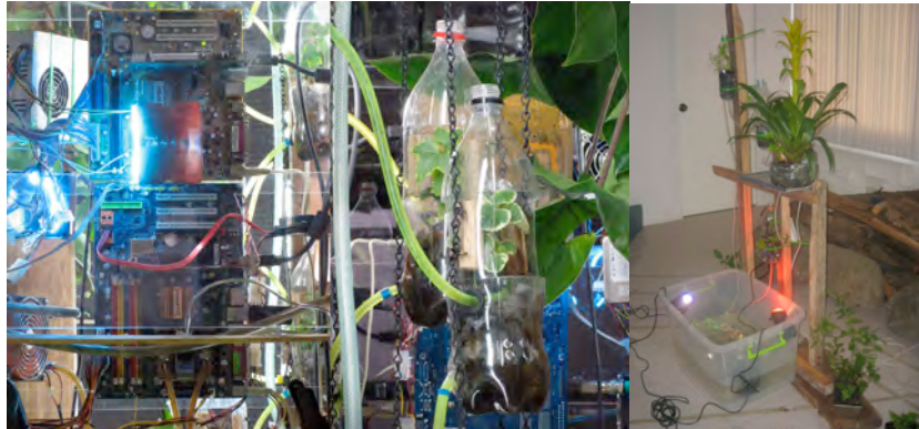
Figure 4. The aquaponic system in Biomodd[LBA 2 ]

But from thereon, the water was neither tracked nor reused to benefit other subsystems in the installation. The learners identified a solution: incorporate an aquaponic -inspired system that combines fish rearing with plant growing, using waste products from the fish to fertilize the plants growing in a non-soil medium, and then returning the water back to the tropical fish tank to form a closed system [13]. The insight was due in large part to one of the experiences of the learners in actually managing an aquaponic tilapia-growing system.