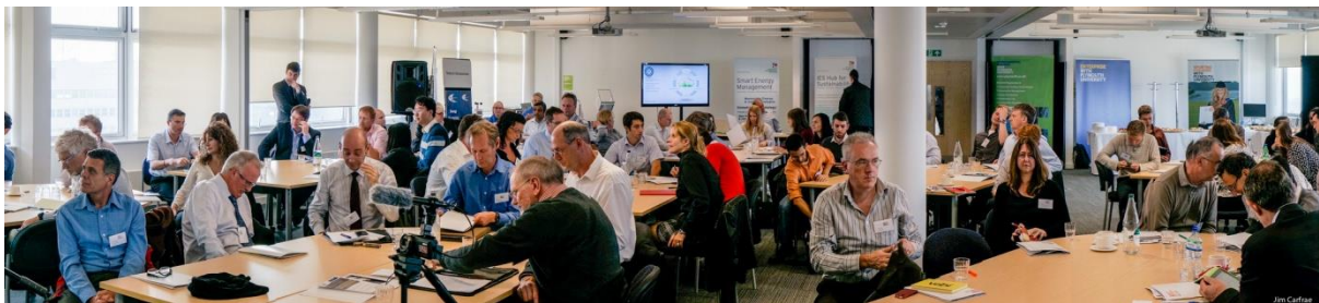
Figure 4: Delegates at the Plymouth University workshop, 25/10/2013.

The current views on the energy performance gap within the UK industry were discussed at a workshop at Plymouth University on 25 October 2013; see Figure 4. This workshop consisted of presentations by invited speakers as well as a forum discussion. Access to the workshop was available for a small admission fee; with the event having been announced widely through networks like IBPSA-England (the regional affiliate of the International Building Performance Simulation Association) and Constructing Excellence. The delegates were self-selected.