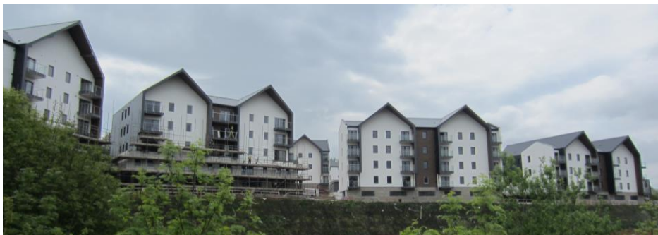
Figure 5: Monitored domestic development in Torquay, Devon.

The variations in energy demand between the identical monitored homes will be correlated with occupant behavioural factors, such as the frequency and duration of window and door opening, daily heating period, chosen heating set point temperatures, proportion of home heated and operation of the MVHR system.