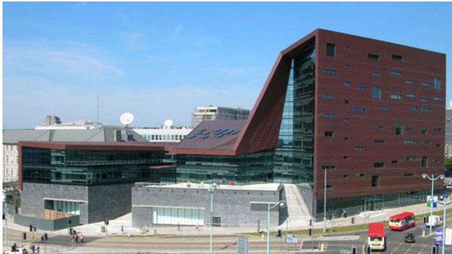
Figure 1: Roland Levinsky Building at Plymouth University, UK

In order to propagate design uncertainties in the EnergyPlus model, this was linked to the GeorgiaTech Uncertainty and Risk Analysis Workbench GURA-W [14].