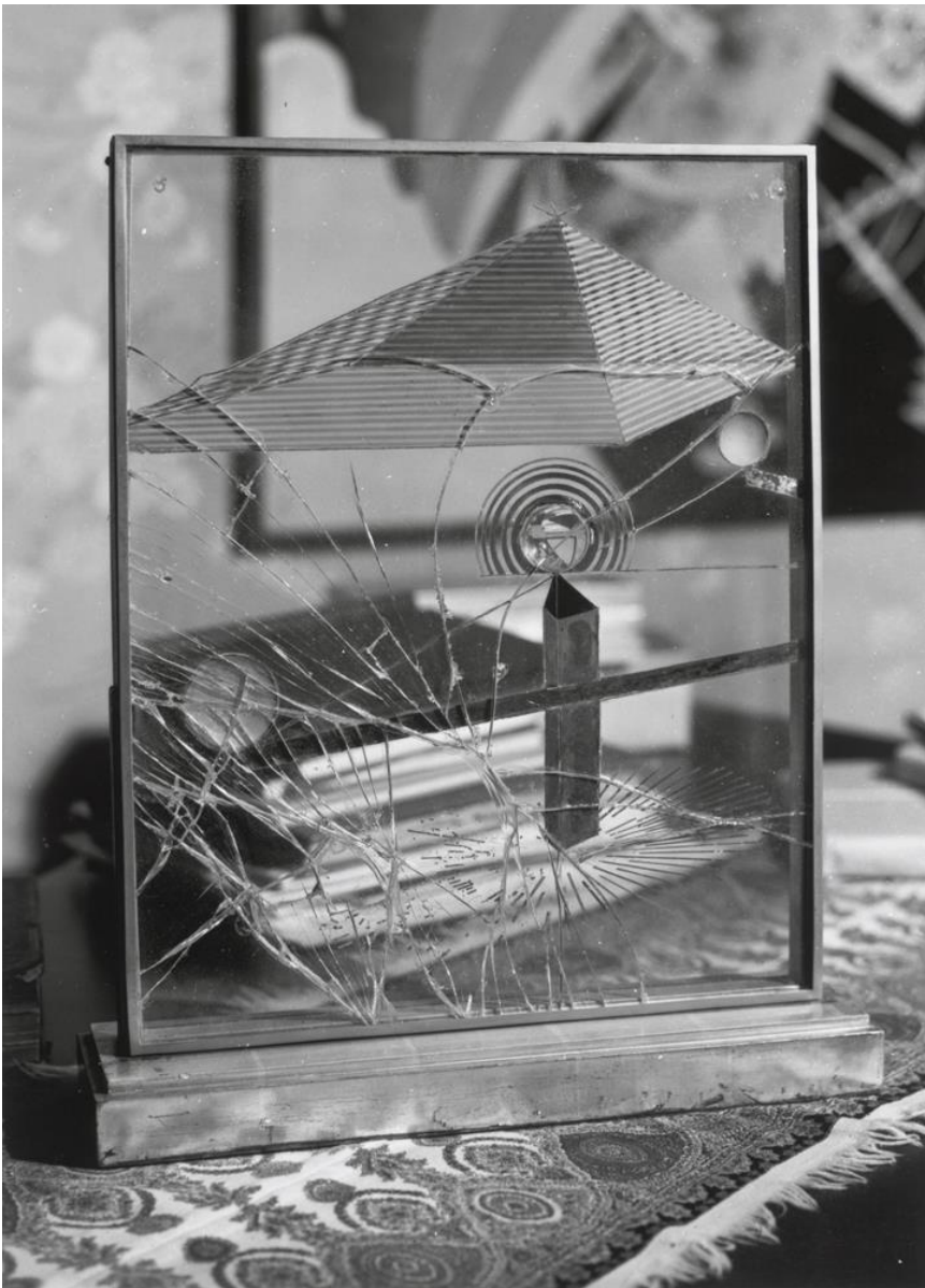
Figure 3: Small Glass, framed