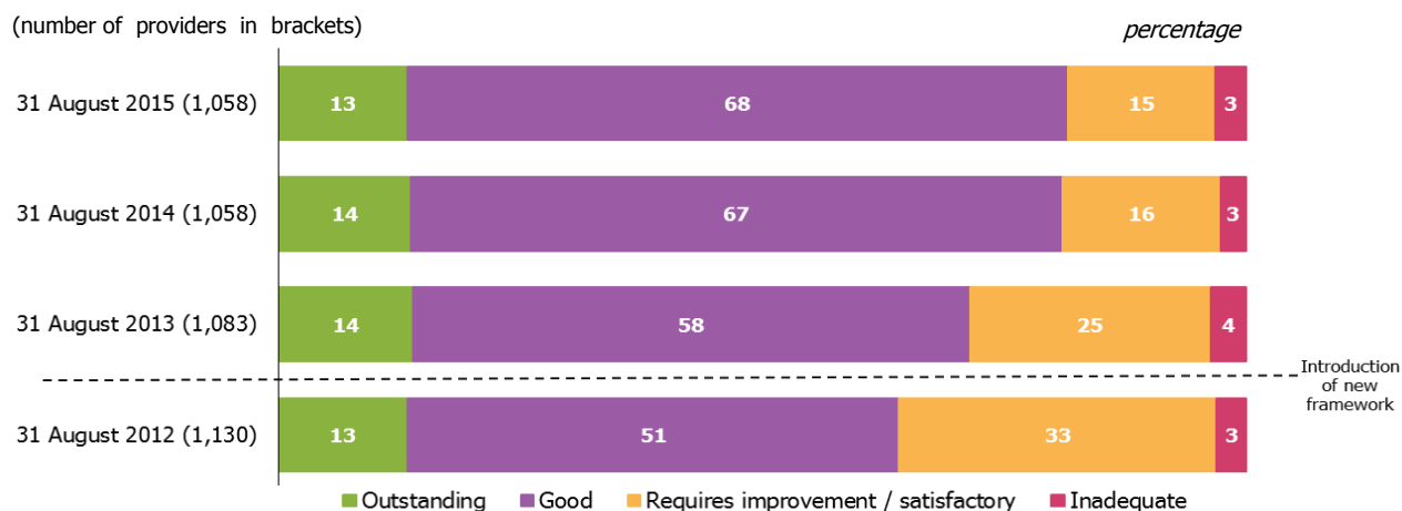
Figure 1: Most recent overall effectiveness of further education and skills providers 1

In 2014/15, 57% of providers previously judged good or outstanding declined at their latest inspection, compared with 44% during 2013/14.