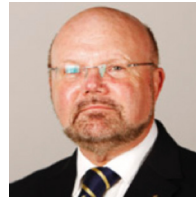
Colin Beattie Scottish National Party