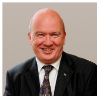
Gordon MacDonald Scottish National Party