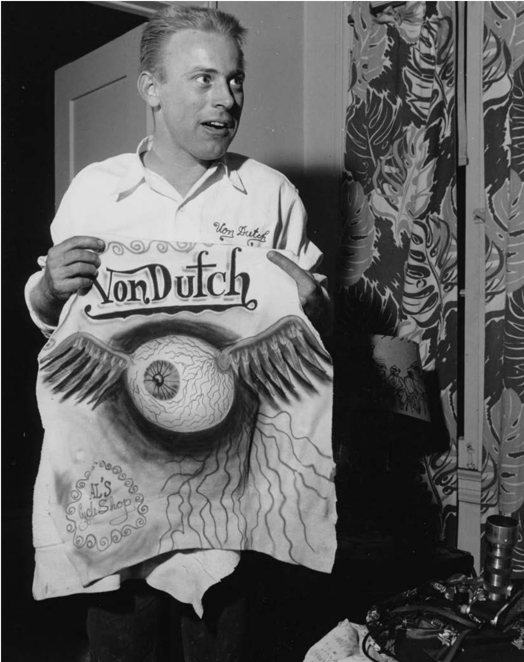
5.4 Von Dutch, c.1956, photographed for the US teen magazine Dig , Private collection.

gan tattooing seriously in 1907 whilst taking art classes at Yale, the points of similarity and departure become apparent. 20