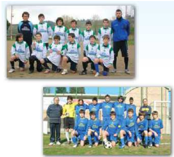
Figure 3. An example of identical repetition by using only visuals (See Table 1). Also in this case the identical repetition is obtained by illustrating the concept of “sport” or “charity to sports club” by only using series of visual (Davison2014; Durand 1987). The bank introduces a paragraph whose caption is devoted to the bank’s charity activity towards sports clubs, but the concept is impressed on the readers’ mind by only relying on repetition from the same type of device: the visual one - which can act on emotional drivers (Mancia, 2006).