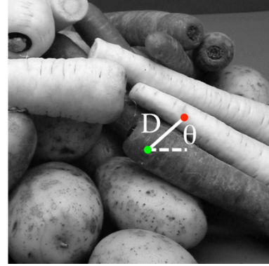
Fig. 2. Participants judged whether the point in the scene indicated by the red or green dot was the closer; the distance between the points ( D ) and the direction of their separation ( \theta ) are indicated.

A further complication in trying to understand how binocular cues contribute to depth perception is that the results that we obtain from sparse stimuli do not readily generalize to more complex scenes. A striking demonstration of this is the fact that simple ordinal depth judgments are more reliable for individual points in empty space than they are for the same points lying on objects defined by multiple cues [13]. The deterioration in performance in this study occurred despite the fact that the surfaces contained much more information about the