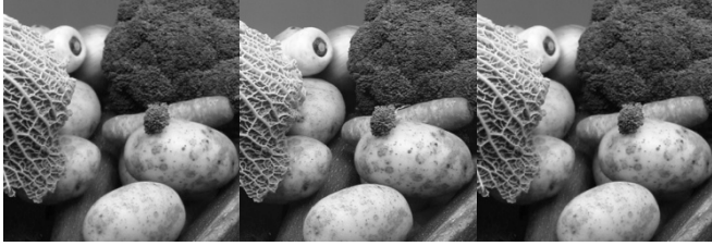
Fig. 1. An example of the stereoscopic images used, arranged for uncrossed (left and centre) or crossed (centre and right) viewing.

sign and magnitude of disparity, and knowledge of the viewing geometry [5].