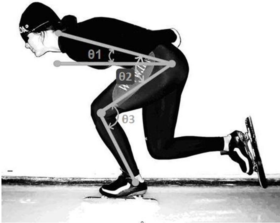
Figure 1: Trunk angle ( \theta_1 ), hip angle ( \theta_2 ) and knee angle ( \theta_3 ).